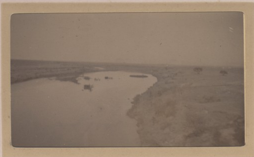
Springbok 11. 12. 1892