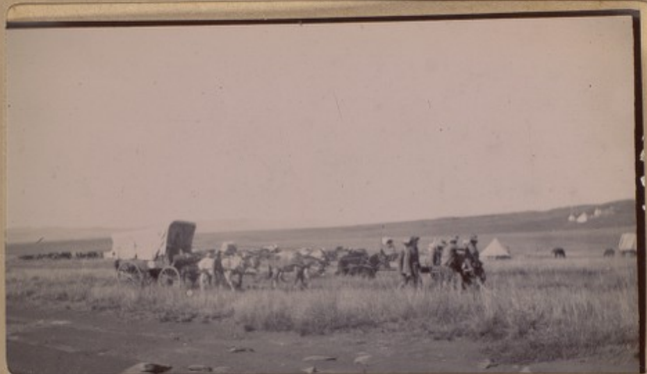
ambulance & stretcher with a man with fracture of base of skull on it.