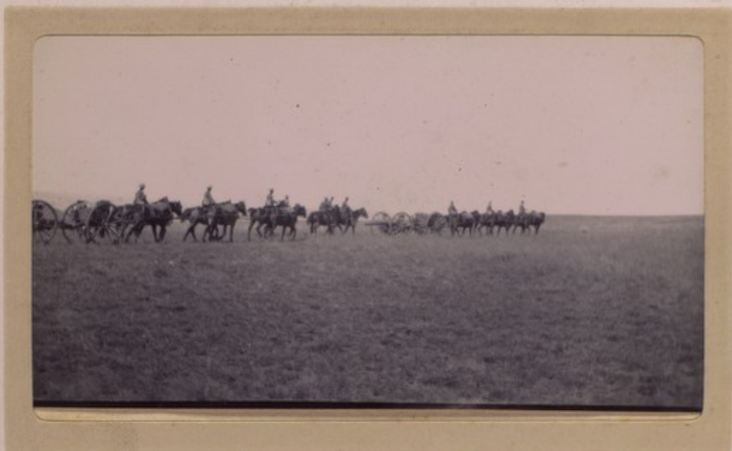
Guns on march