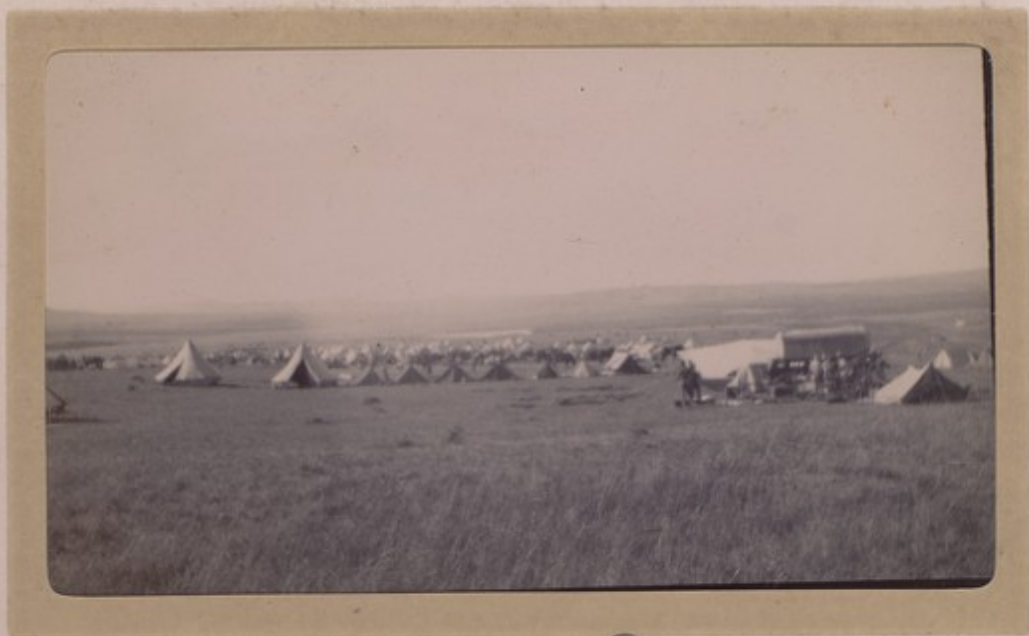
Col. Armstrong's Camp.