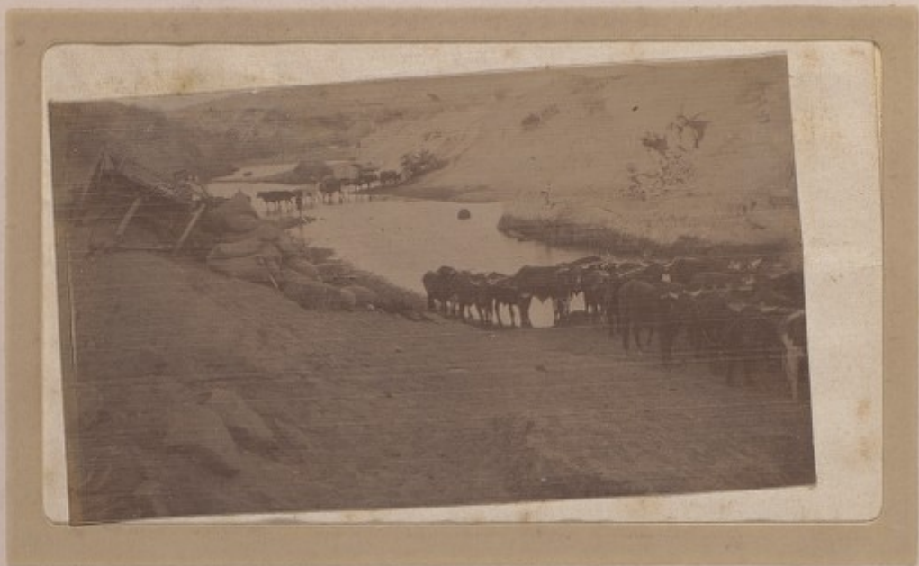
Mudder River at gran