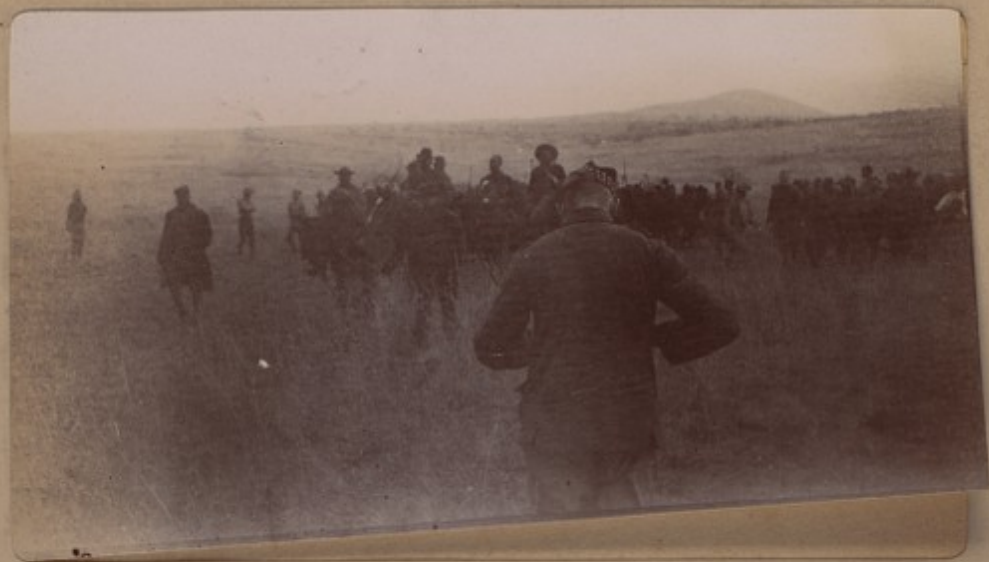
Arrival of Caffar Chief to a Conference in N.E. Manitoba