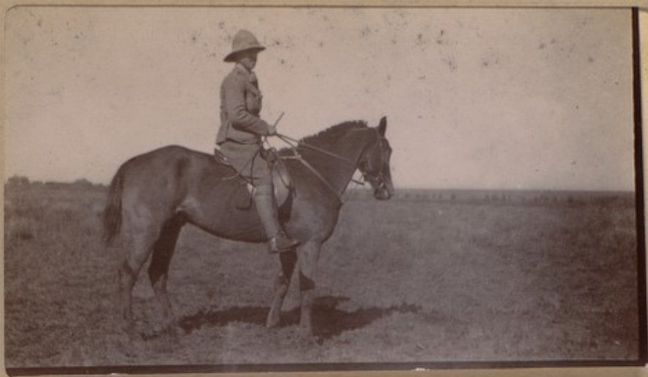
St. Methra (Seymour)