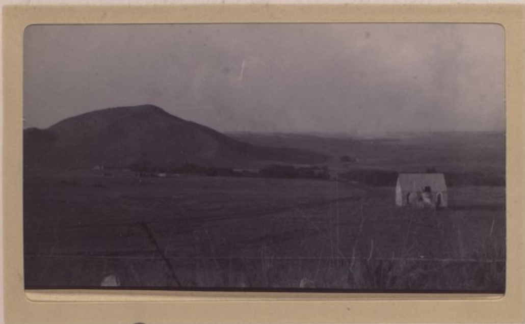
Dullstroom Church (partly destroyed)