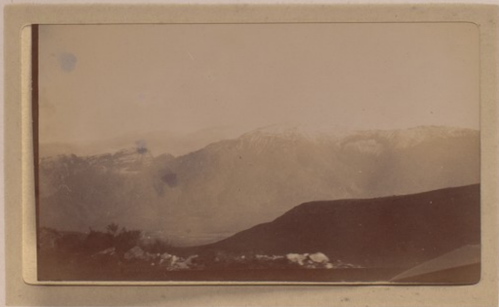
Hot River Mountains