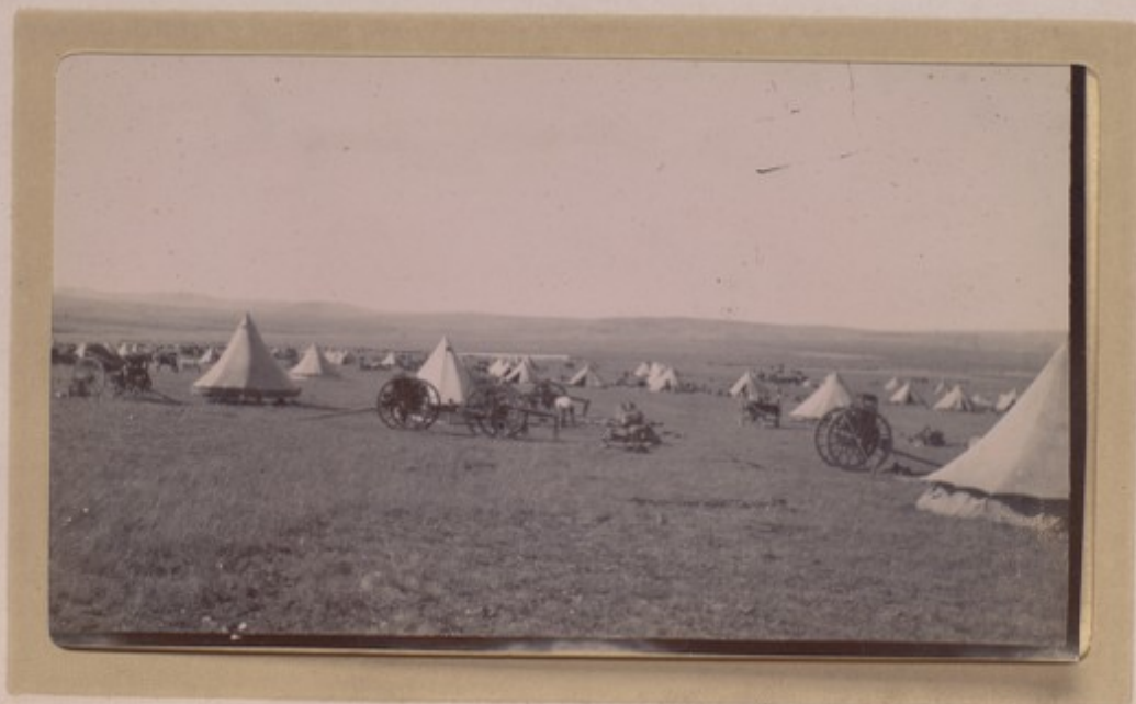
Camp at Helveta