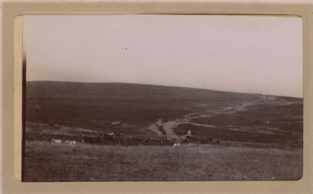
Col. Urnston's Column