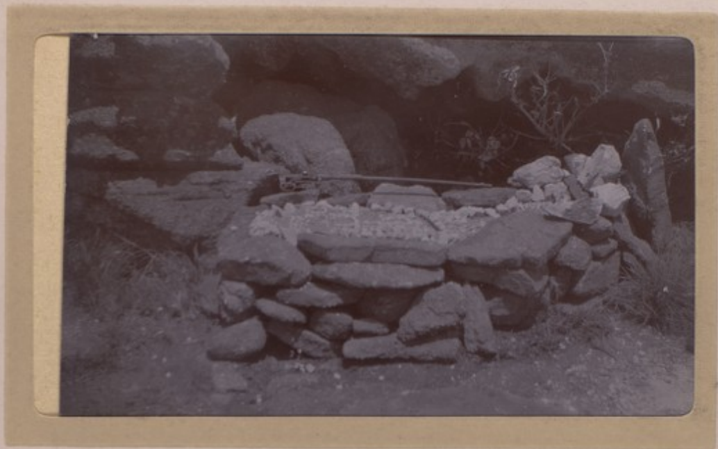
Bierbrauer in Moschelsbach 18. Juni 1904