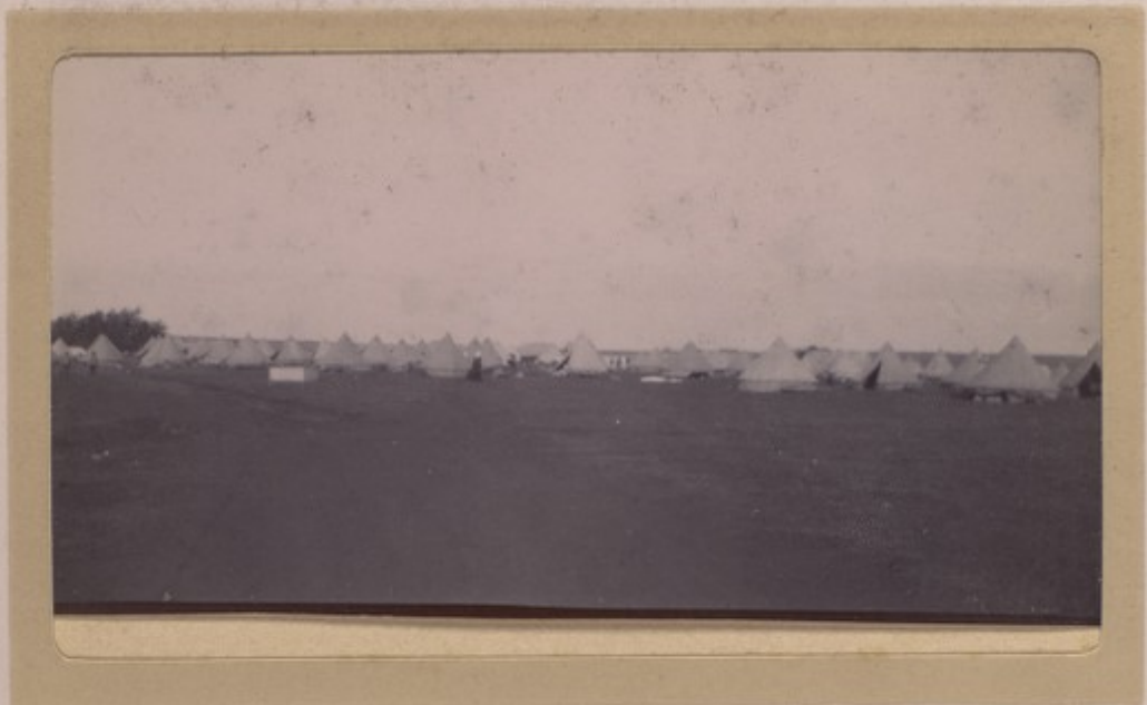
Belfast Refugee Camp