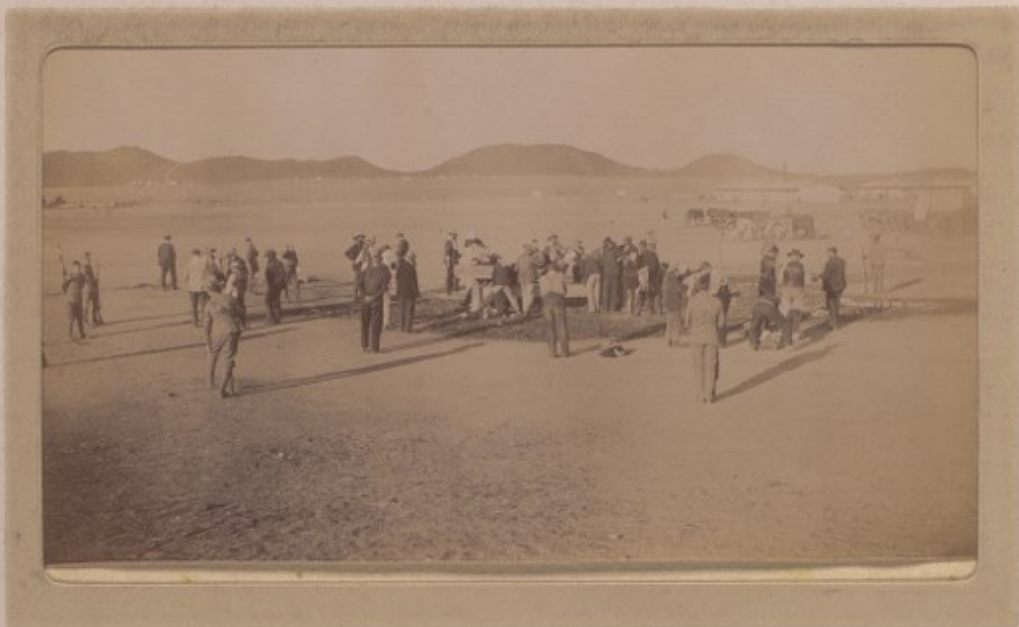
Bolds washing at Delmar