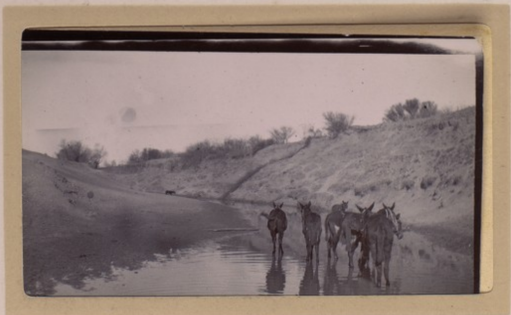
Mules in Moudou River