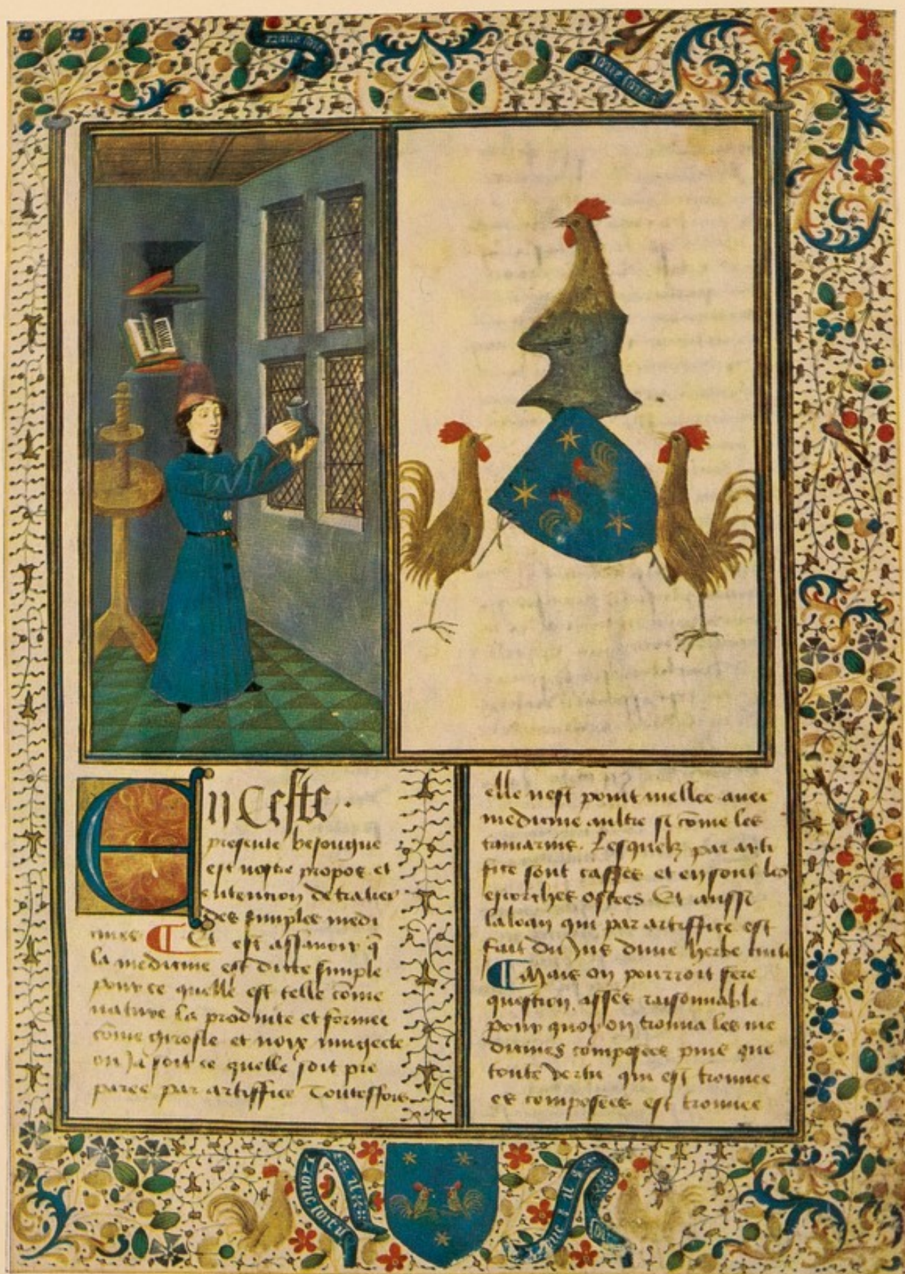
The first page of MS. 626 (Platearius, Circa instans , c. 1480). This volume was written at Cluny for a member of the Dubois family, whose arms and motto appear above. The physician inspecting the urine flask was the stock symbol for medicine in the Middle Ages.