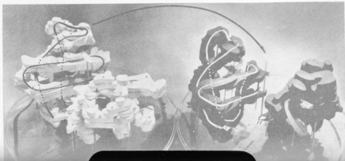
Fig. 9 (left) with hemoglobin