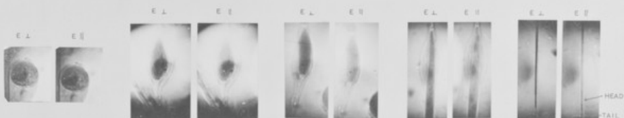
SPERMATID \lambda = 2650