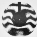
40% CO. 0.7 NA.