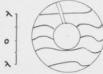
IDEALISED INTERFEROGRAMS \lambda = 5461 \text{ \AA}