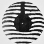
40% CO. 0.5 NA.