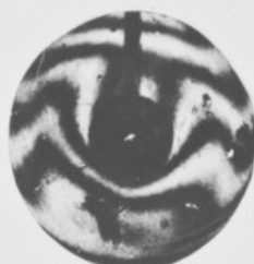
MIRRORS TOO CLOSE TOGETHER