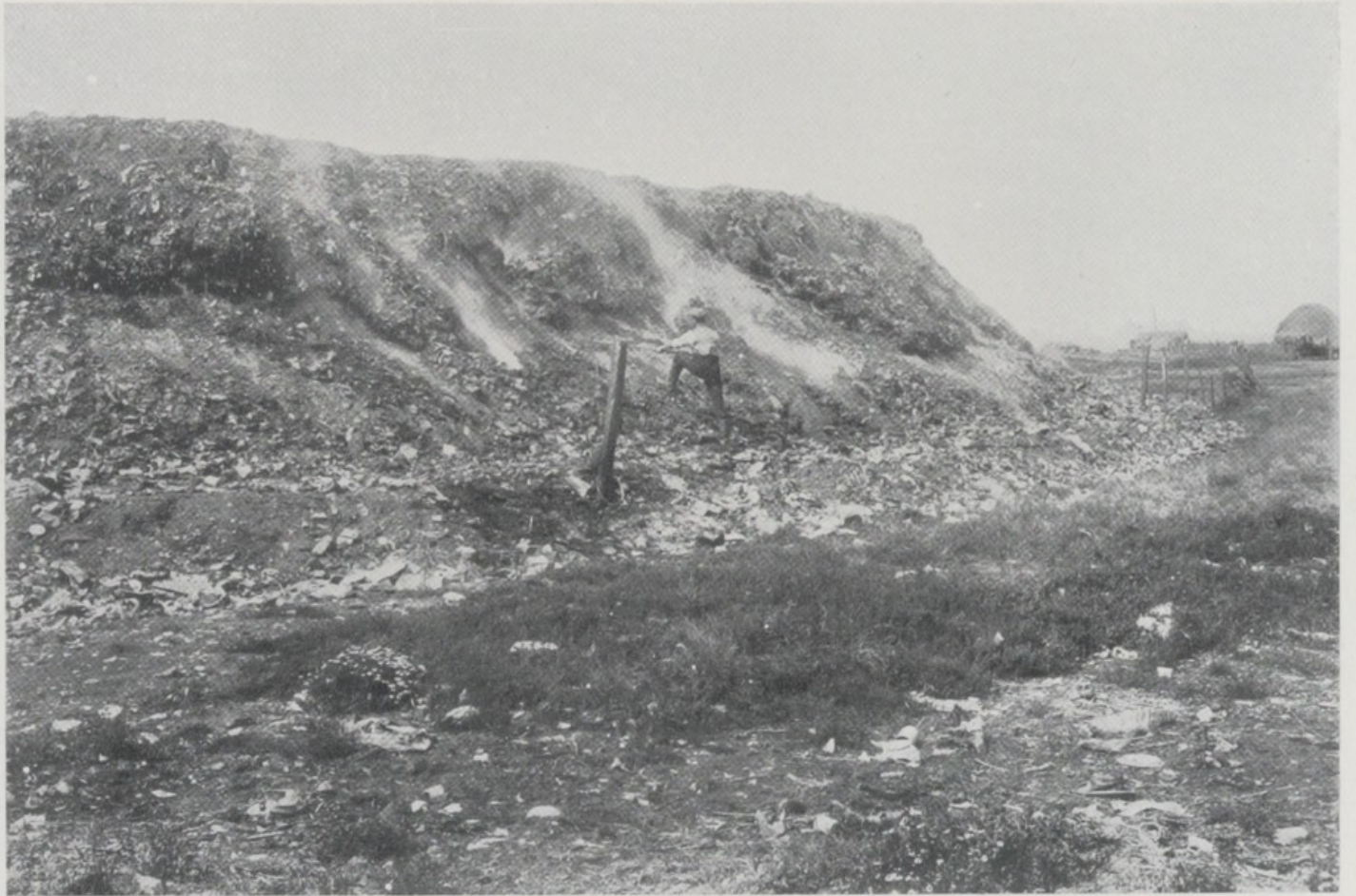
SIDE OF SHOOT SHOWING FIRES.