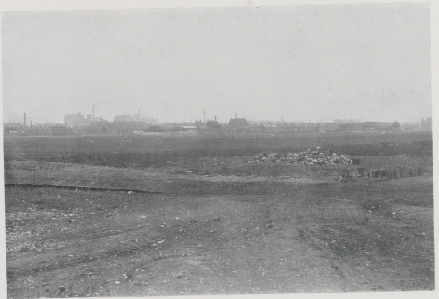
VIEW FROM SHOOT LOOKING SOUTH-WEST.