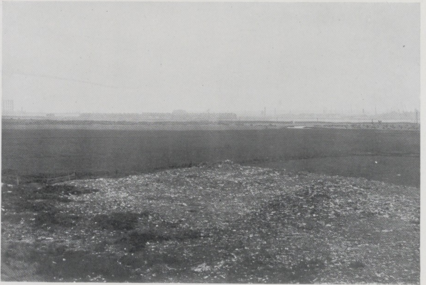
VIEW FROM SHOOT LOOKING SOUTH-EAST.