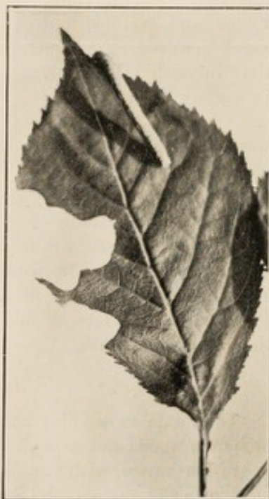
FIG. 52. CATERPILLAR OF THE MARCH MOTH.

The eggs hatch in April. The small larvæ soon spread about. The caterpillar (Fig. 52) is bright green or green tinged with yellow (the latter I have particularly noticed when feeding on hawthorn) and somewhat paler between the segments; on the back is a narrow dark green line, edged with pale creamy white or grey; on each side are three pale lines, either white or grey; the head is uniformly green. The general form at once separates it from the Winter Moth larva, it being very slender and uniformly cylindrical and about one inch long when mature. Most mature by the end of June or early in July, then fall to the ground, where they form cocoons covered with earth very similar to the Winter Moth. The silk of the cocoon is of a dull yellowish hue and very closely woven together. Porritt (2) mentions that caterpillars which hatched from eggs on the 3rd of April went to earth the middle of