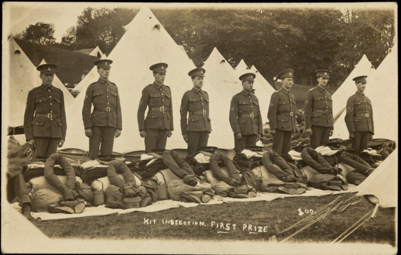
KIT INSPECTION. FIRST PRIZE