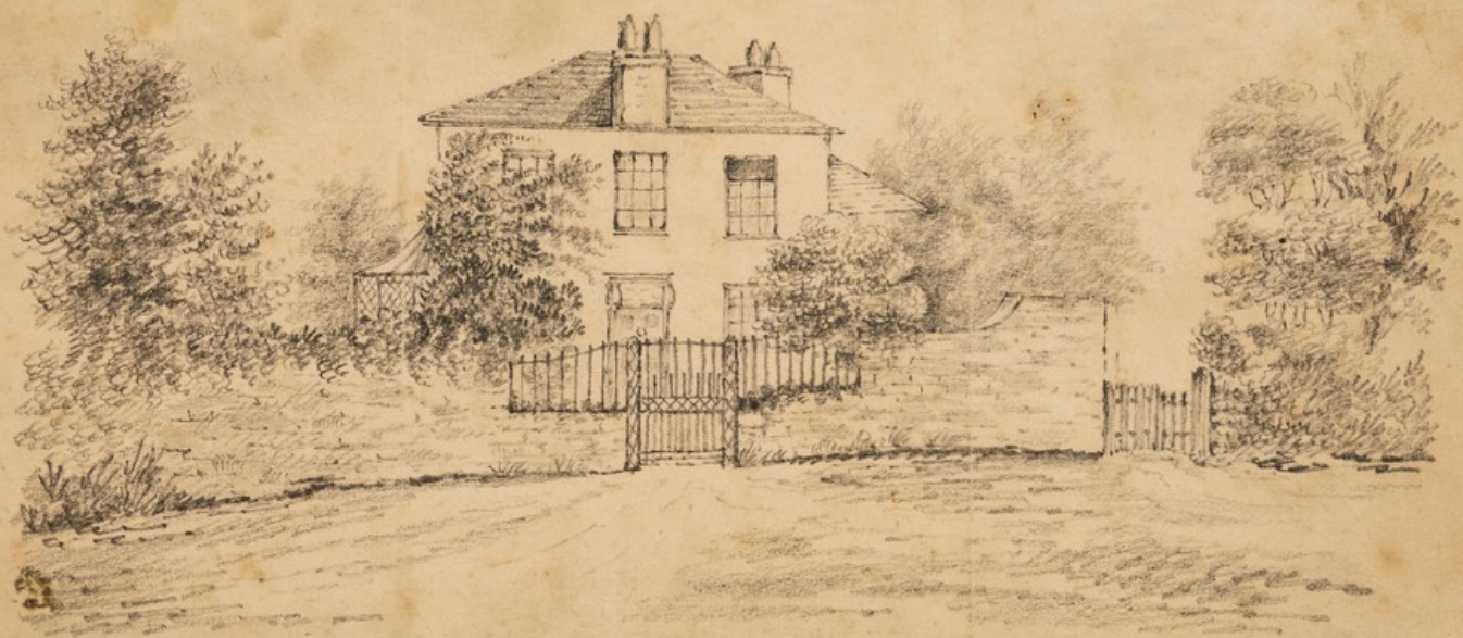
Grove Villa, Cleveland