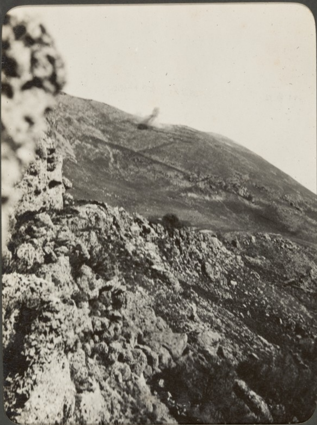
Turkish shell bursting in Montenegro position on Taranbush