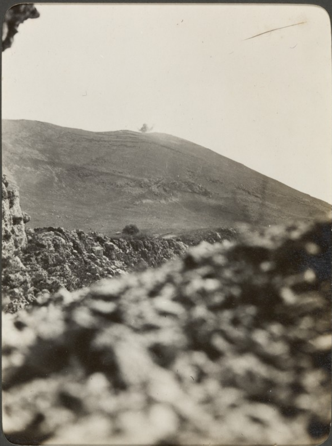
Shells bursting on Tarabush.