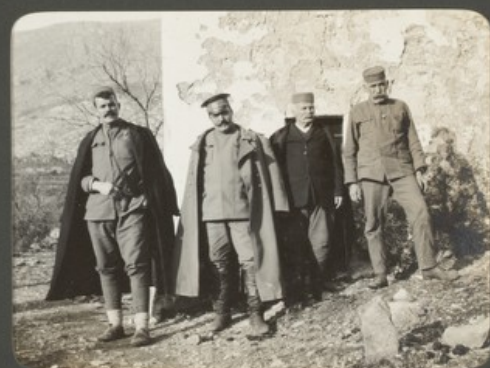
Brig Gen Vachstein