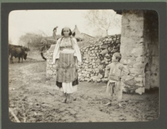
Albanian woman and child.