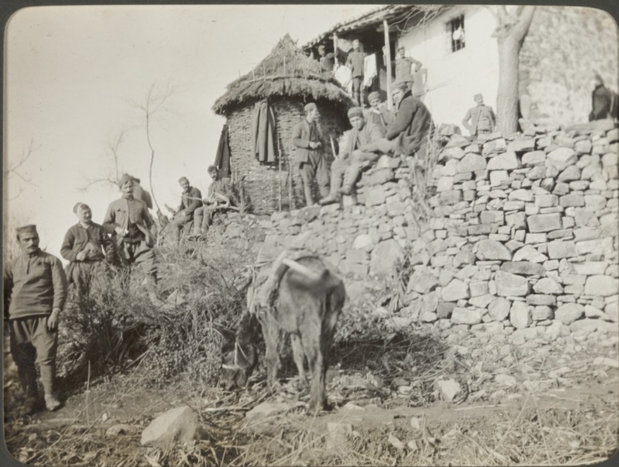
Armenians living in Turkish houses