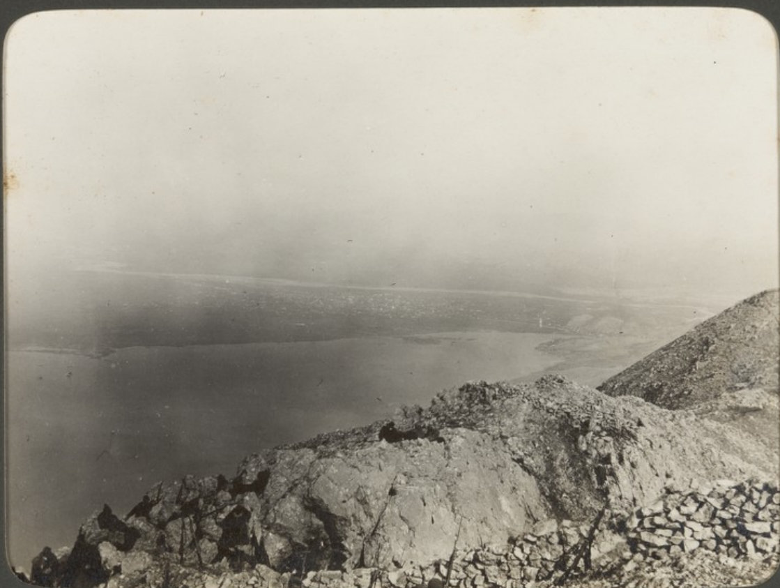
Skutari Lake - The Town in the distance