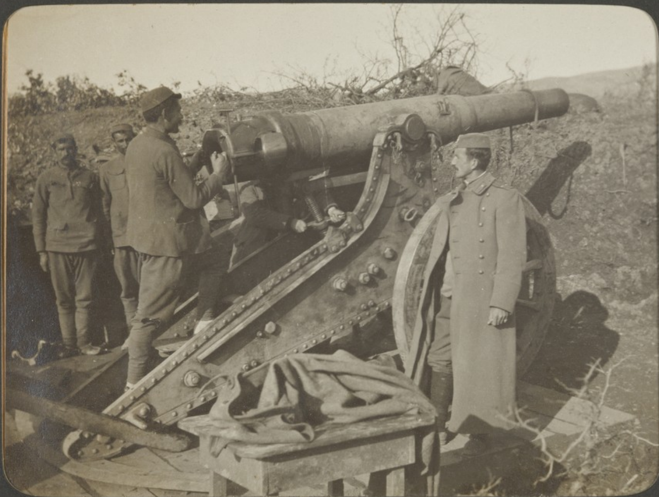
Russian 6" Gun