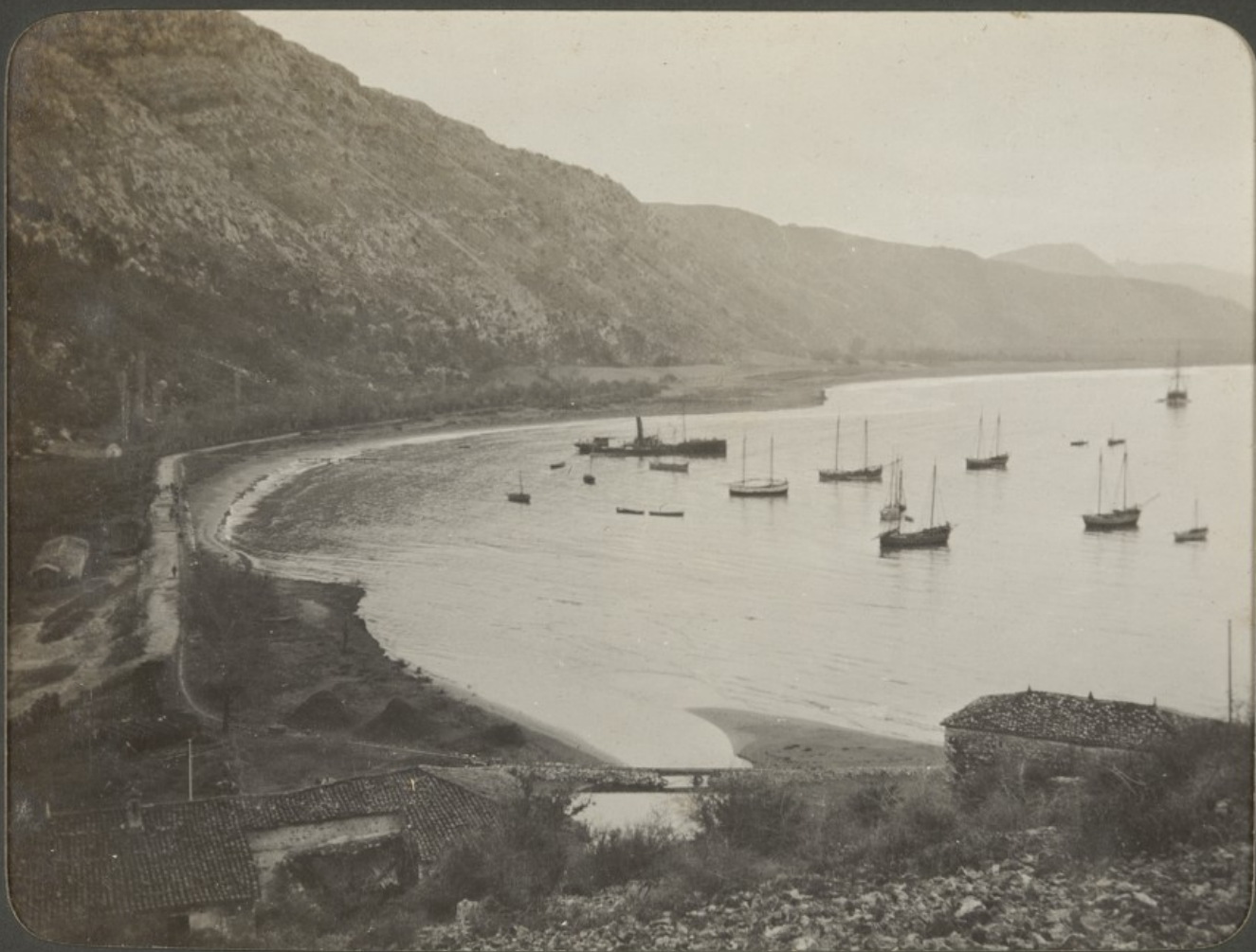
San Giovanni de Medusa