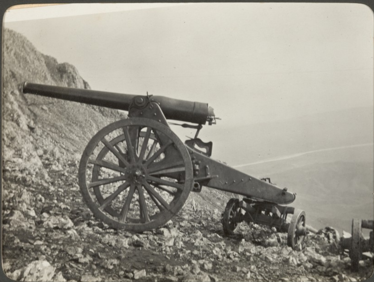
Italian Gun, bulged breech nearly blown out.