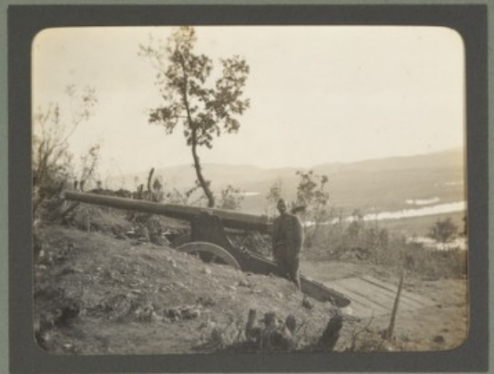
4 th Jan