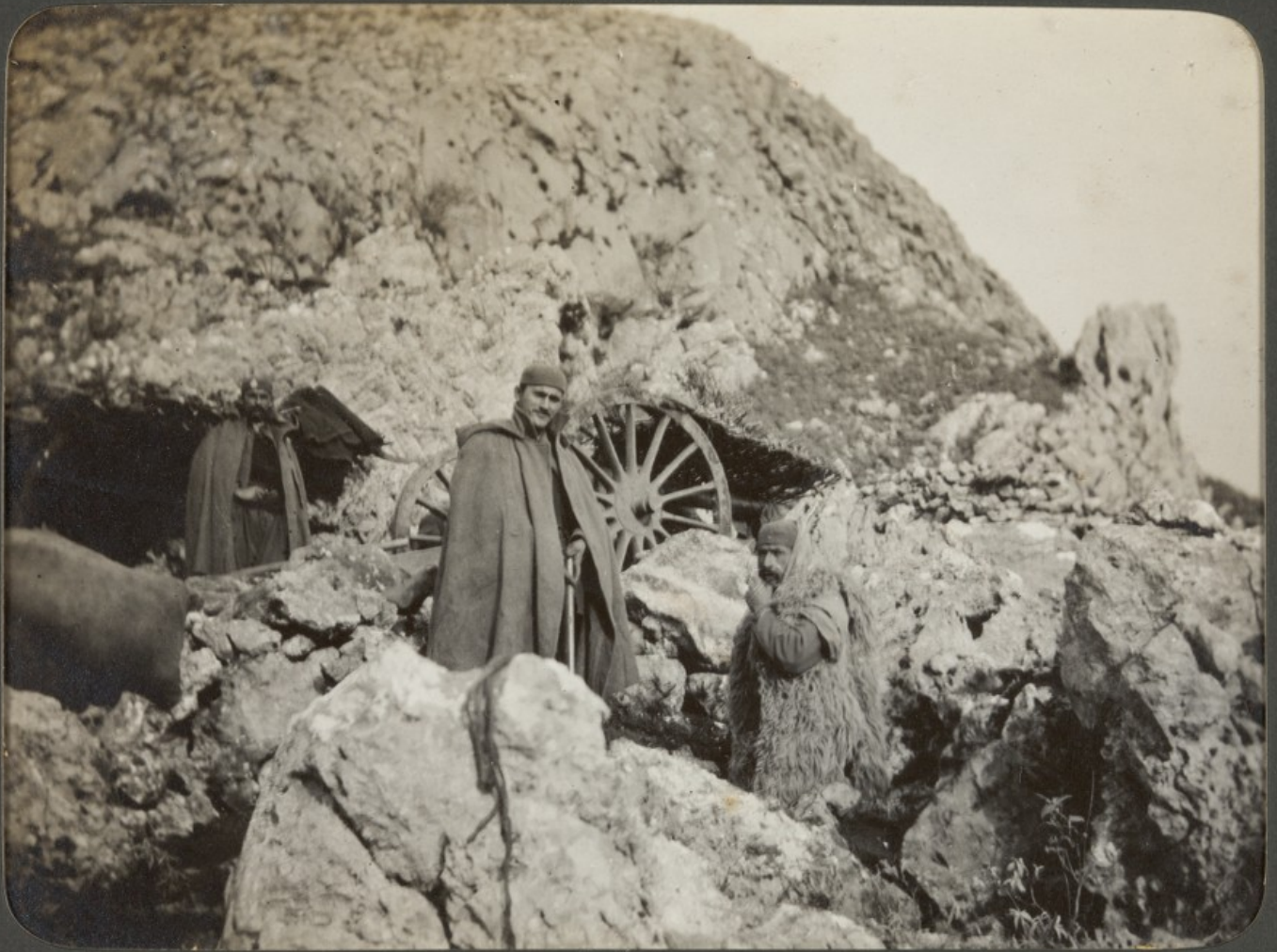
A San pietro