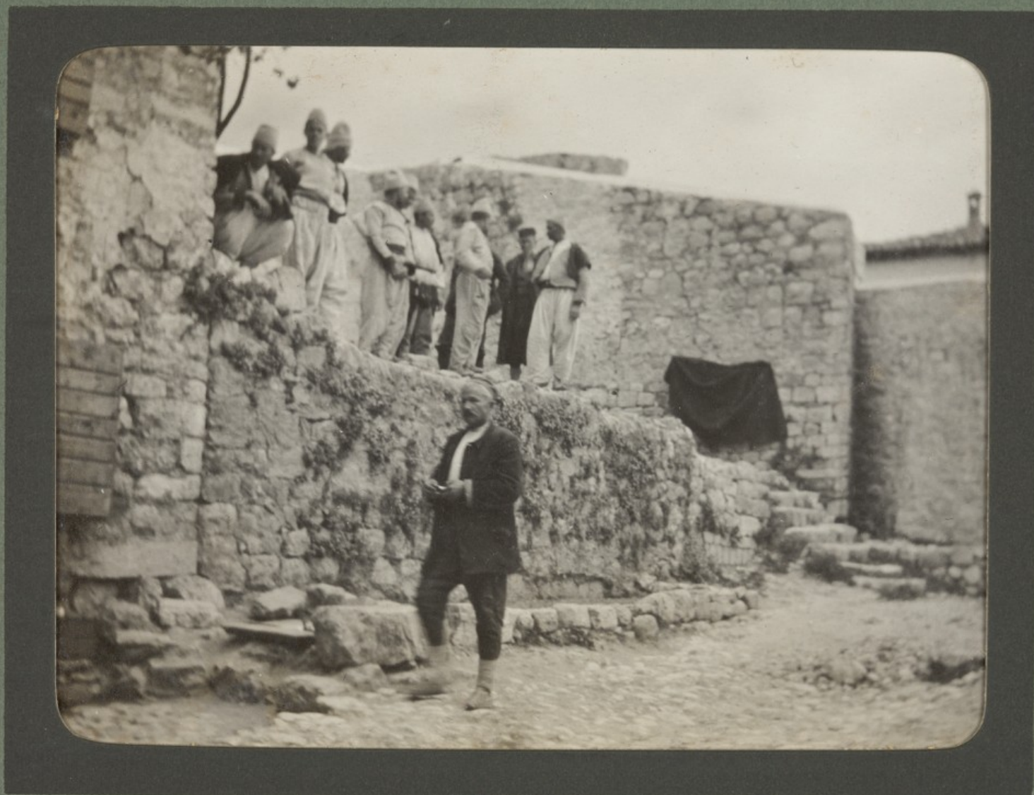
Albanian Prisoners at Old Antwerp