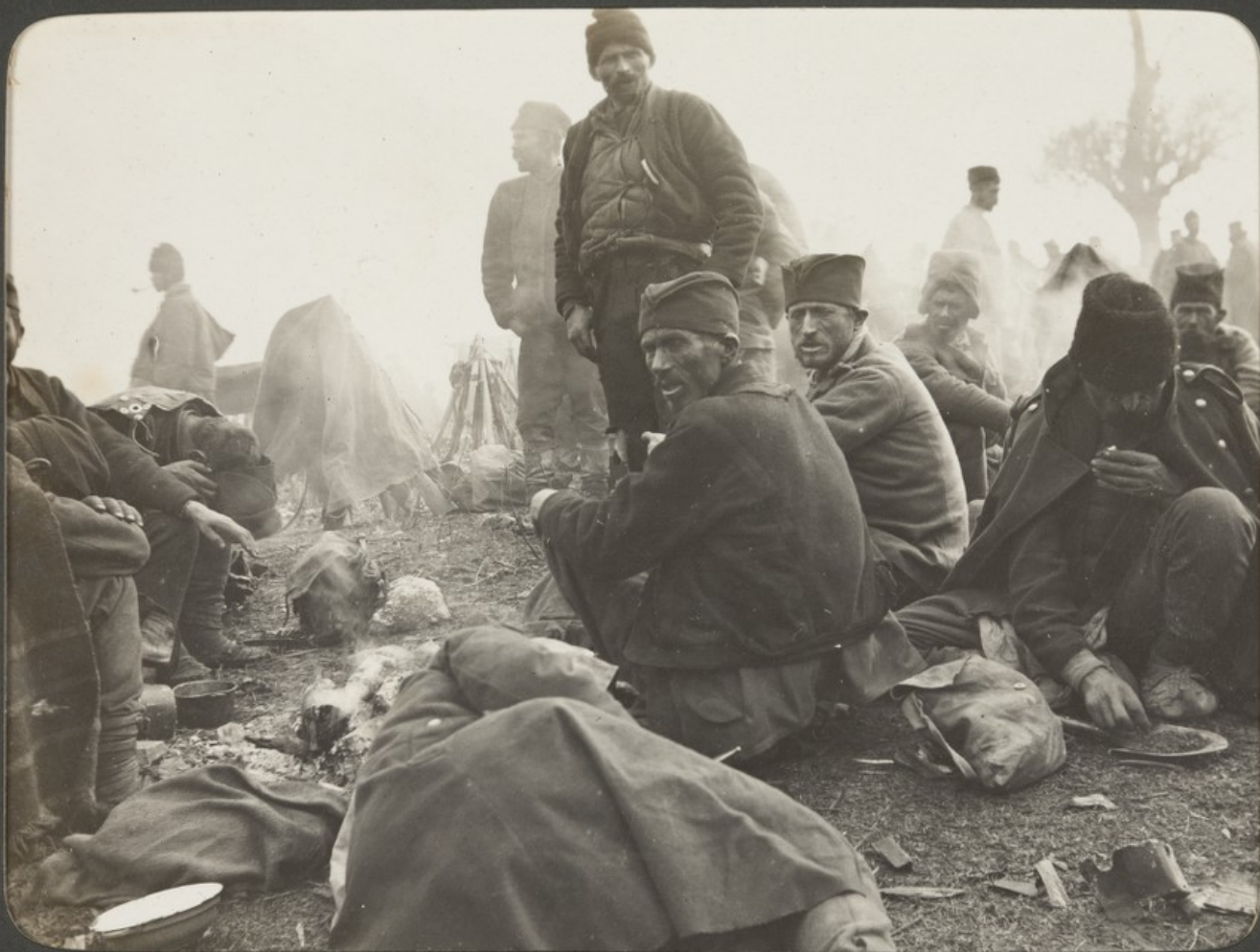
Serbian Infantry at the front.