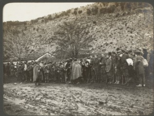
Art Coy of Montenegrins in Metkovic