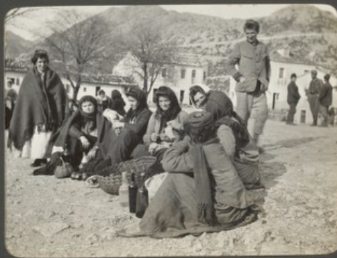
Market-Place - Virpazar