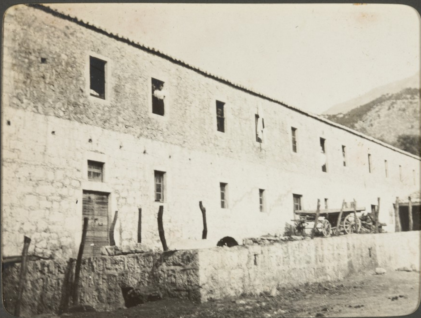
Oliver Old Factory used for Hospital