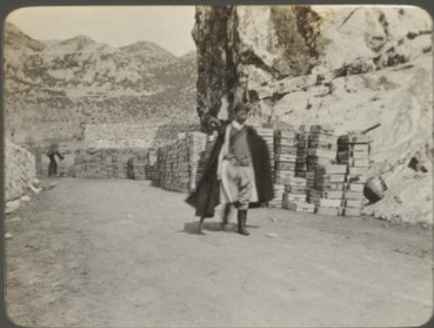
Refr. Ammunition at Virpazar.