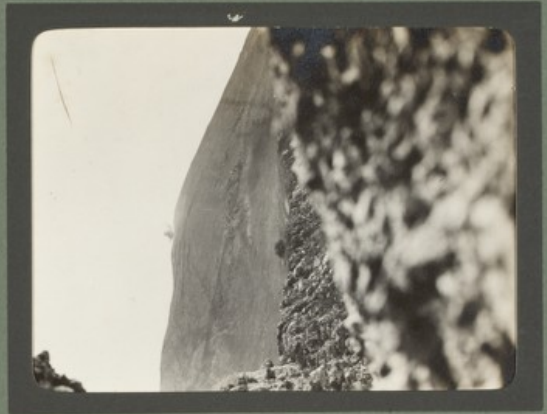
Shells landing on target.