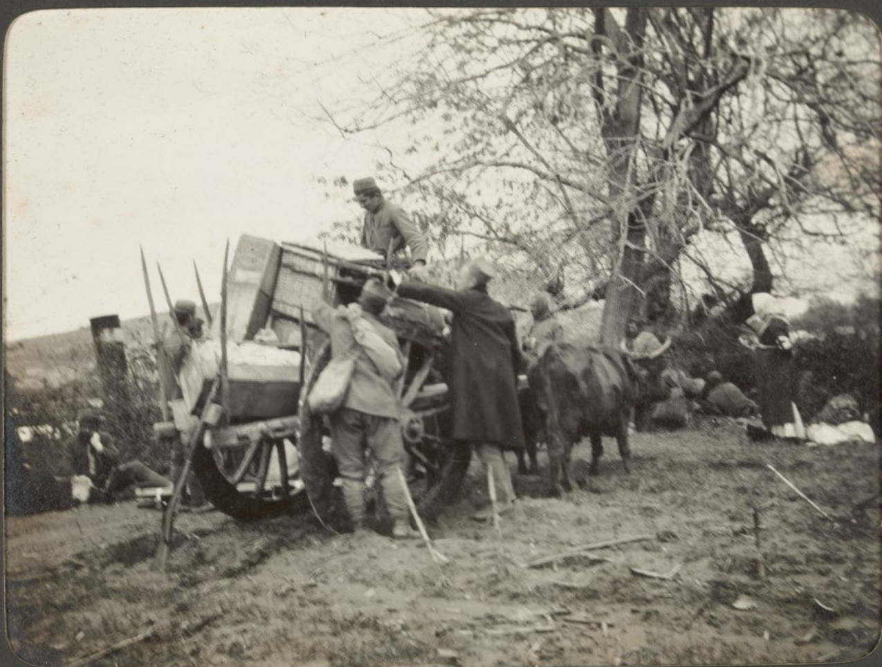
Red Cross moving camp.