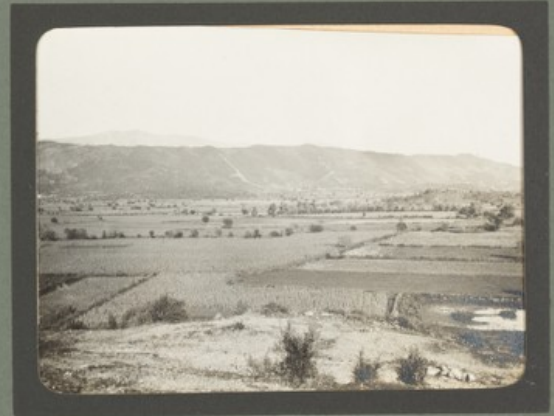
Munichow with Tansboch in the distance