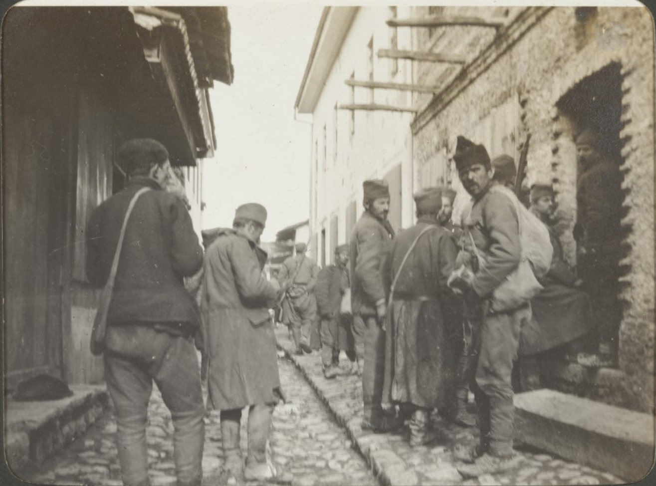
Serbian in Alessio