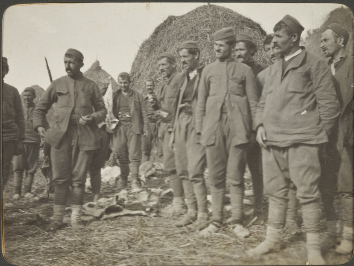
Montgomery in Camp