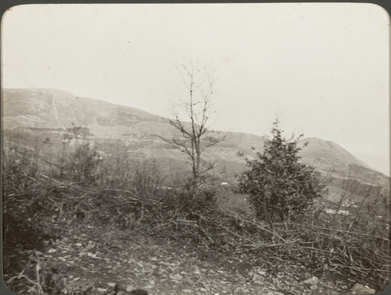
Great & Little Teton.