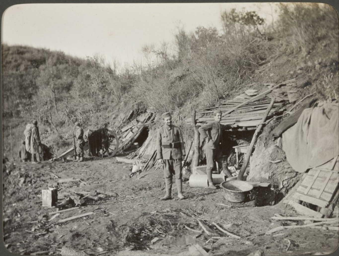
A gun position