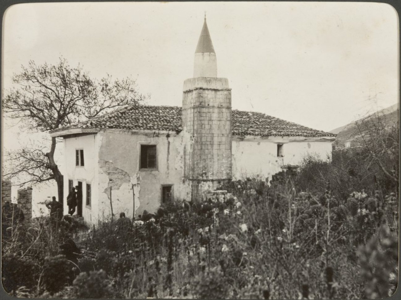
Mosque at Zogaj - Hospital