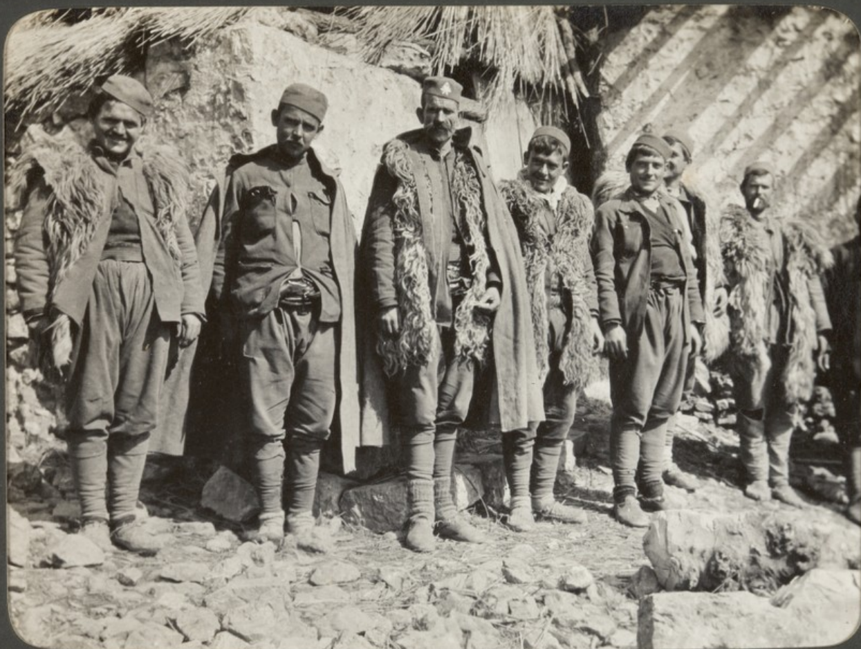
Montenegro, showing sheep-skin coats