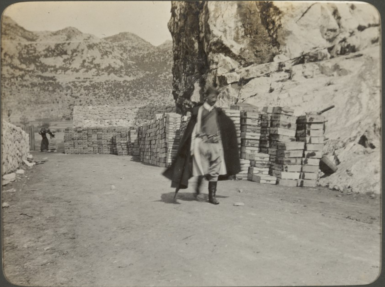
Rifle Ammunition at Vipayan.