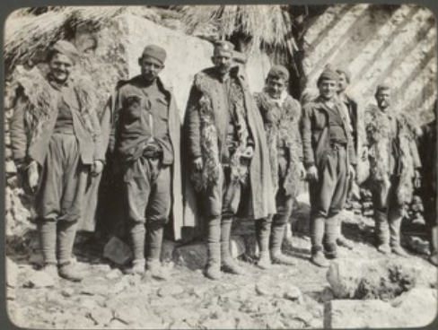
Montenegro, showing sheep-skin coats.