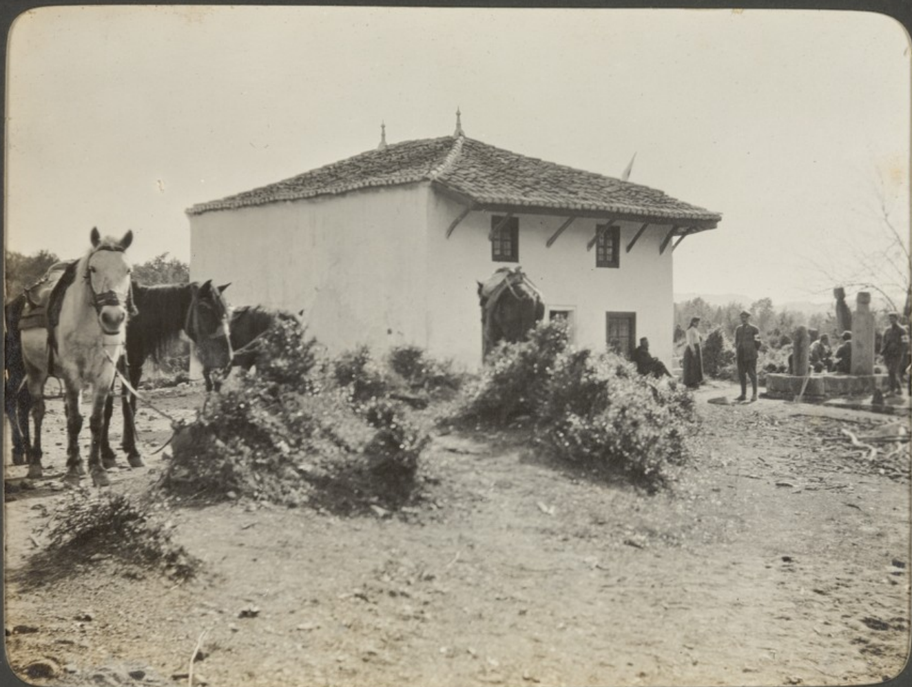
A Red Cross Hospital