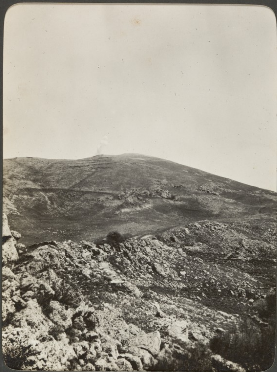
Sheeps hunting on Taurabash in Turkish position.