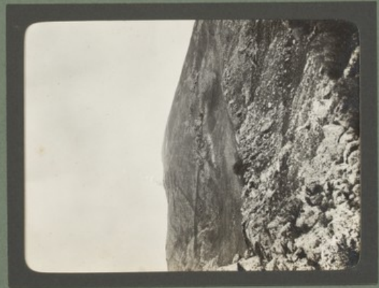
Shells landing on target. in the best position.