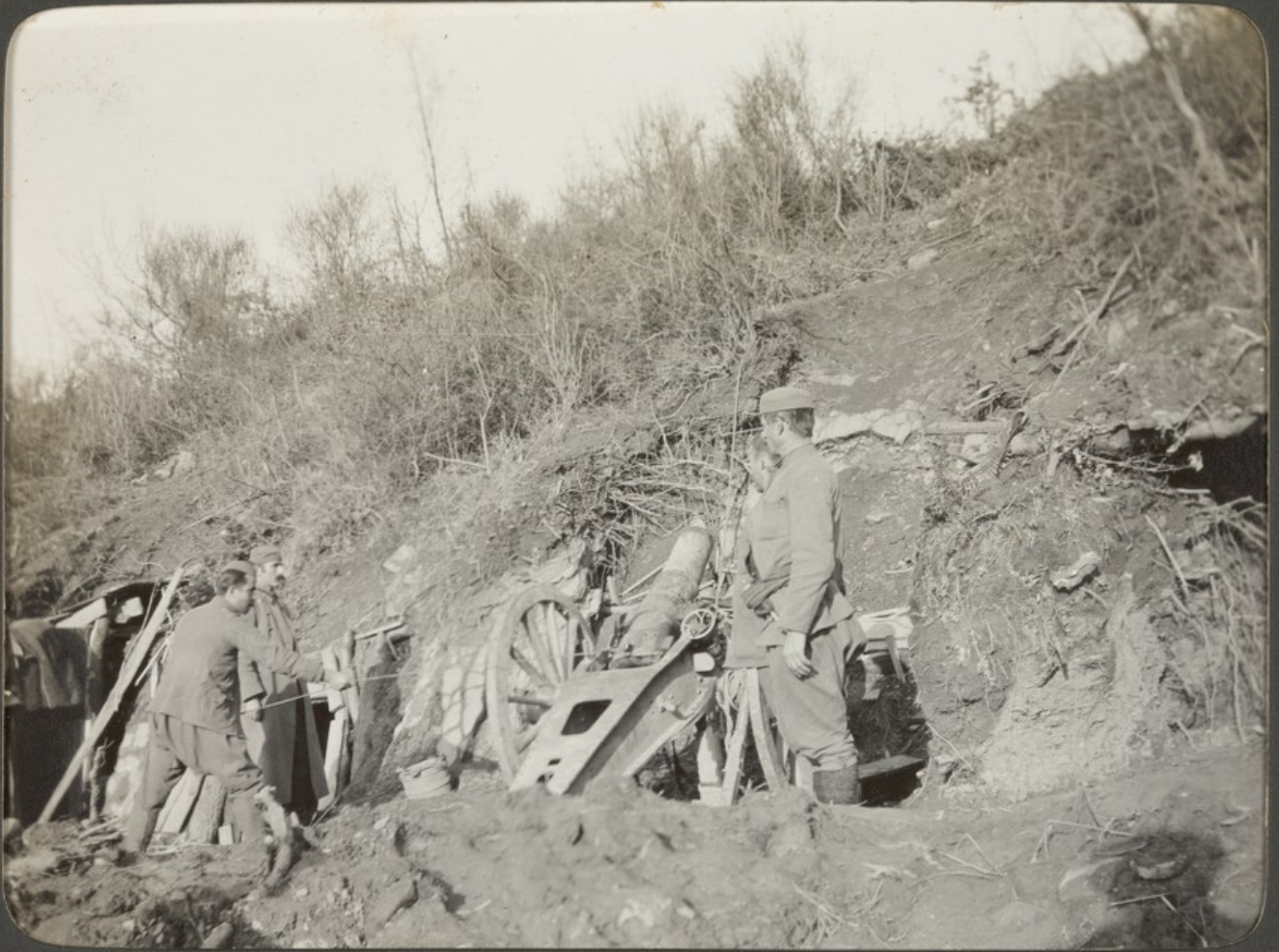
64 Cannon Gun