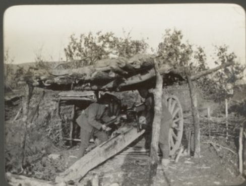
7 cm. Gun