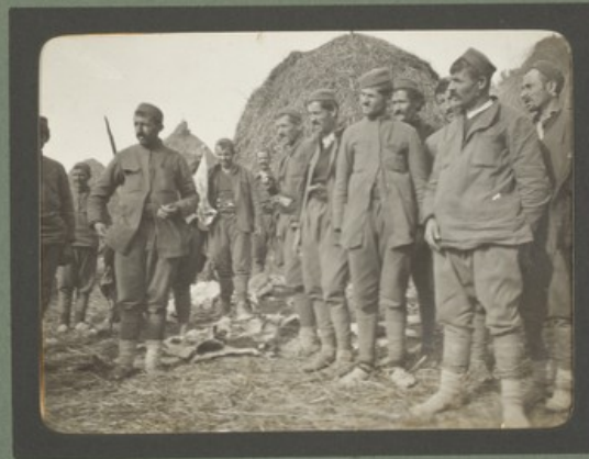
Montenegro in Camp