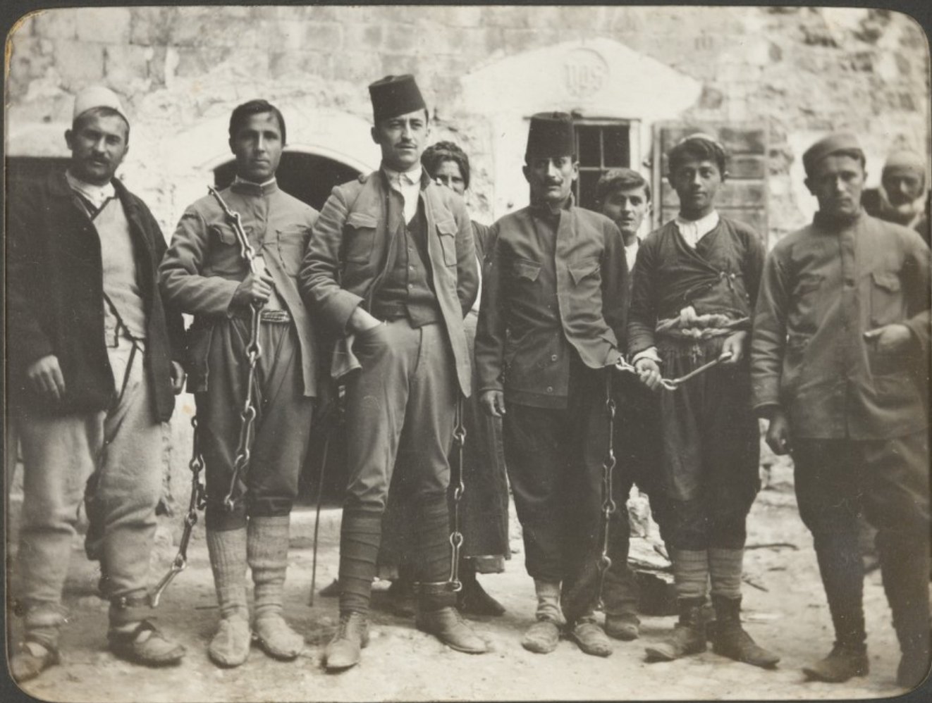
Prisoners of Old Antwerp.