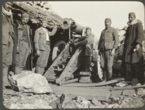
6" Gun - Russian