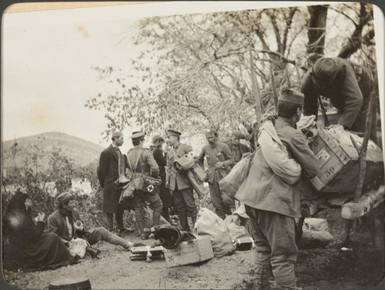
Red Cross moving camp.