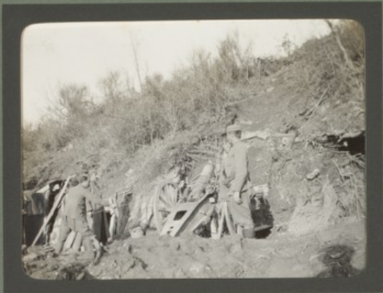
6 th Russian gun