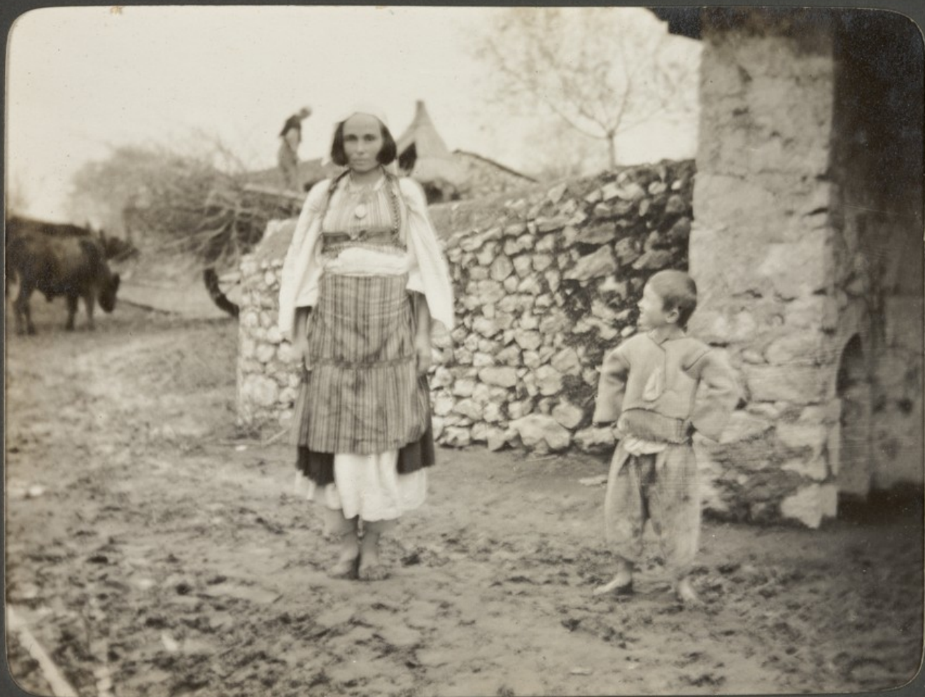
Albanian woman and child.