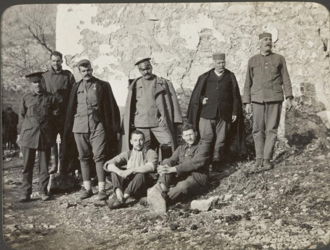
Our Xmas party.