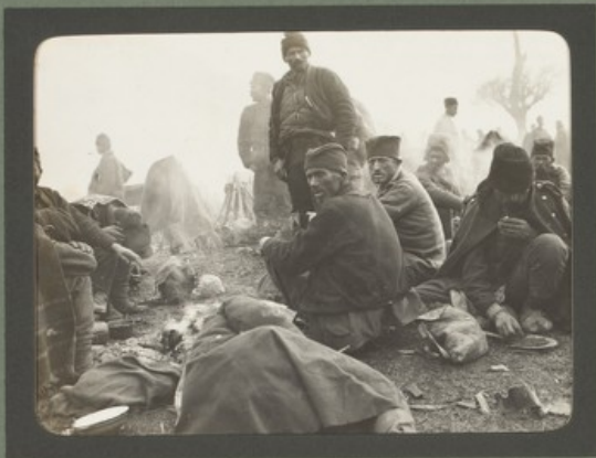
Serbian Infantry at Medina