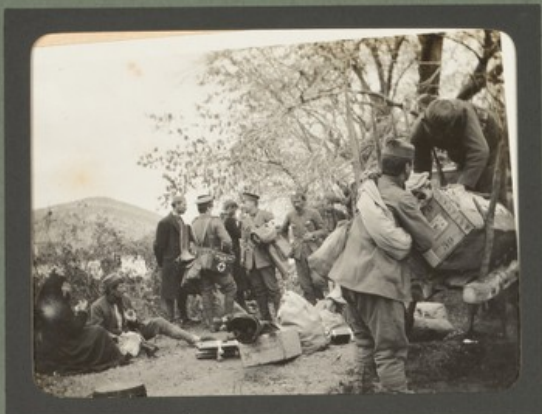
Red Cross moving camp.