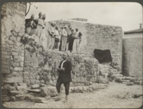
Albanian Prisoners at Old Antivari