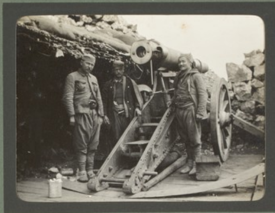
6" Russian gun