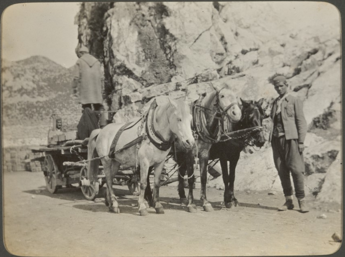
Loading ammunition on wagon.