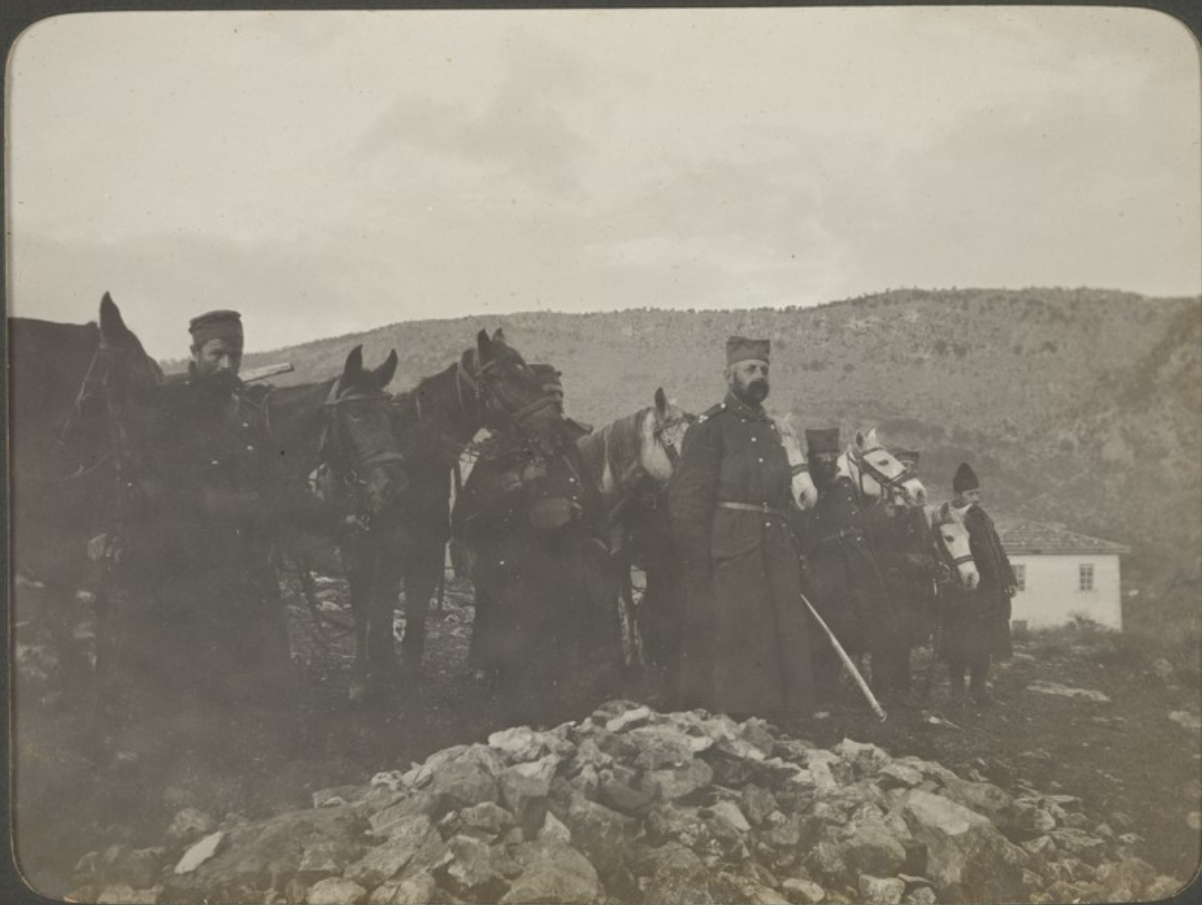
Serbian Cavalry at Medina