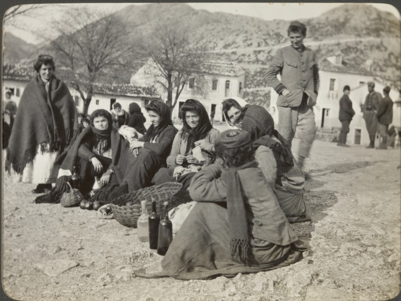
Markt-Platz - Vipava