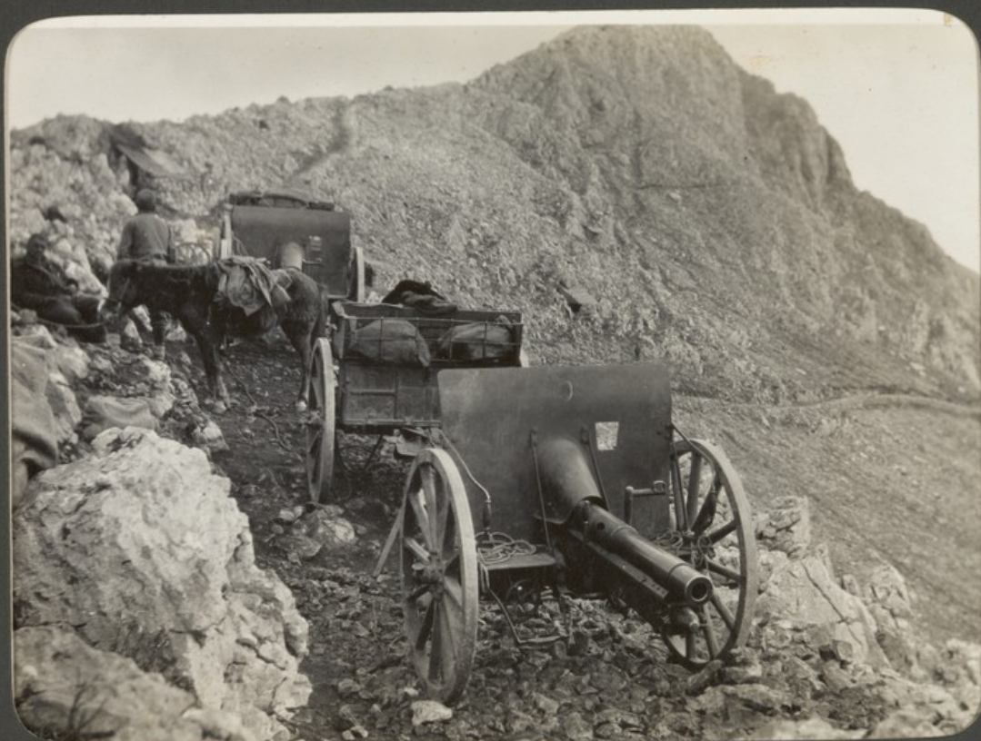
Turkish field guns captured by Serbians.