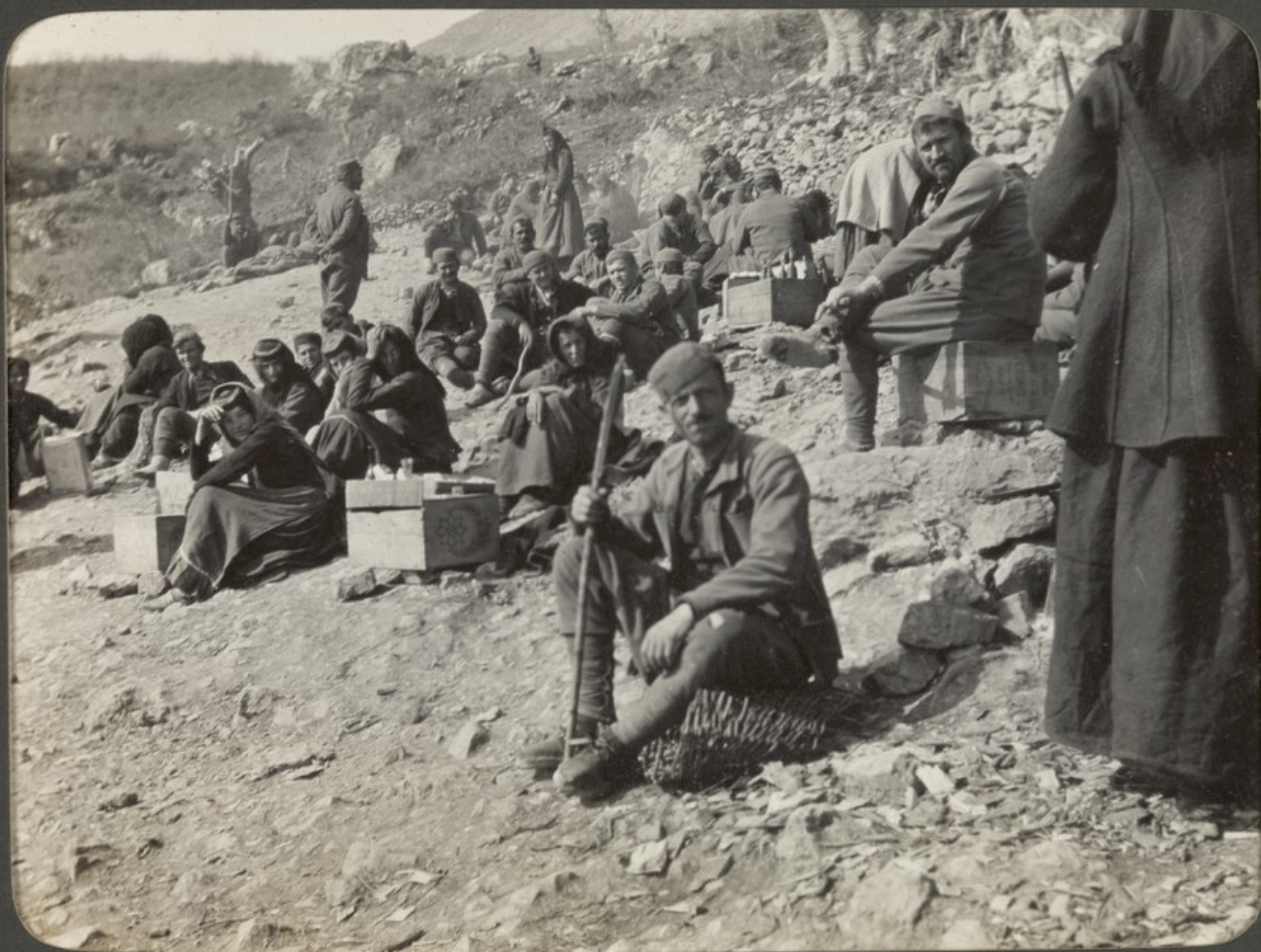
Market Place at B. B. B.