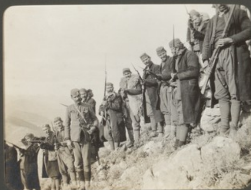
Montenegrins on Plavskagora.