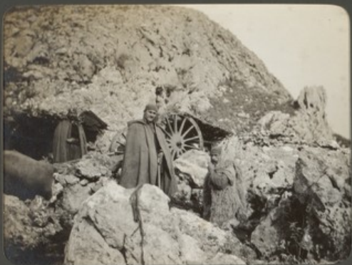
A gun position