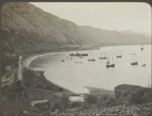
San Giovanni de Medua