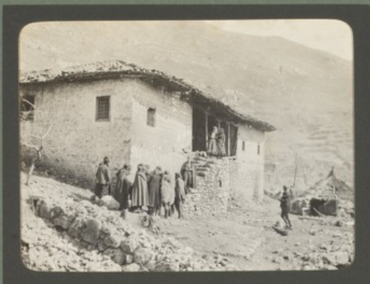
Red Cross house at Boboti.