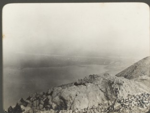
Skutari Lake - the Town in the distance