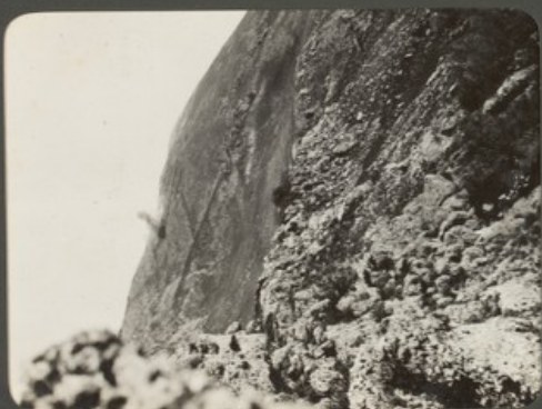
Tuckers Shells bursting in Montenegro position on Faradish