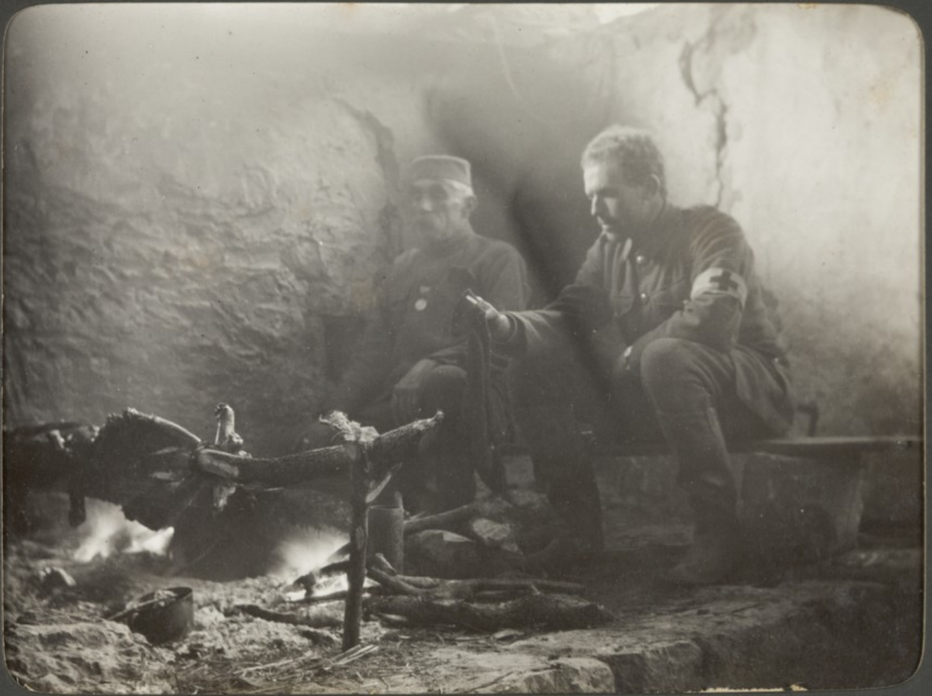
Roasting a goat -