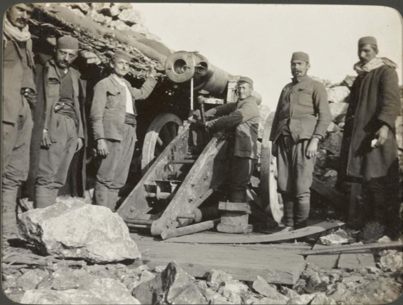
6" Gun - Russian.