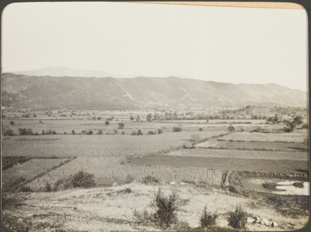
Munichan with Tarabosh in the distance