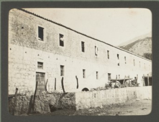
Old factory used for Hospital