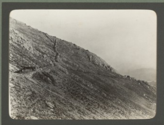
Gun positions on Shirokagora, showing gun roads