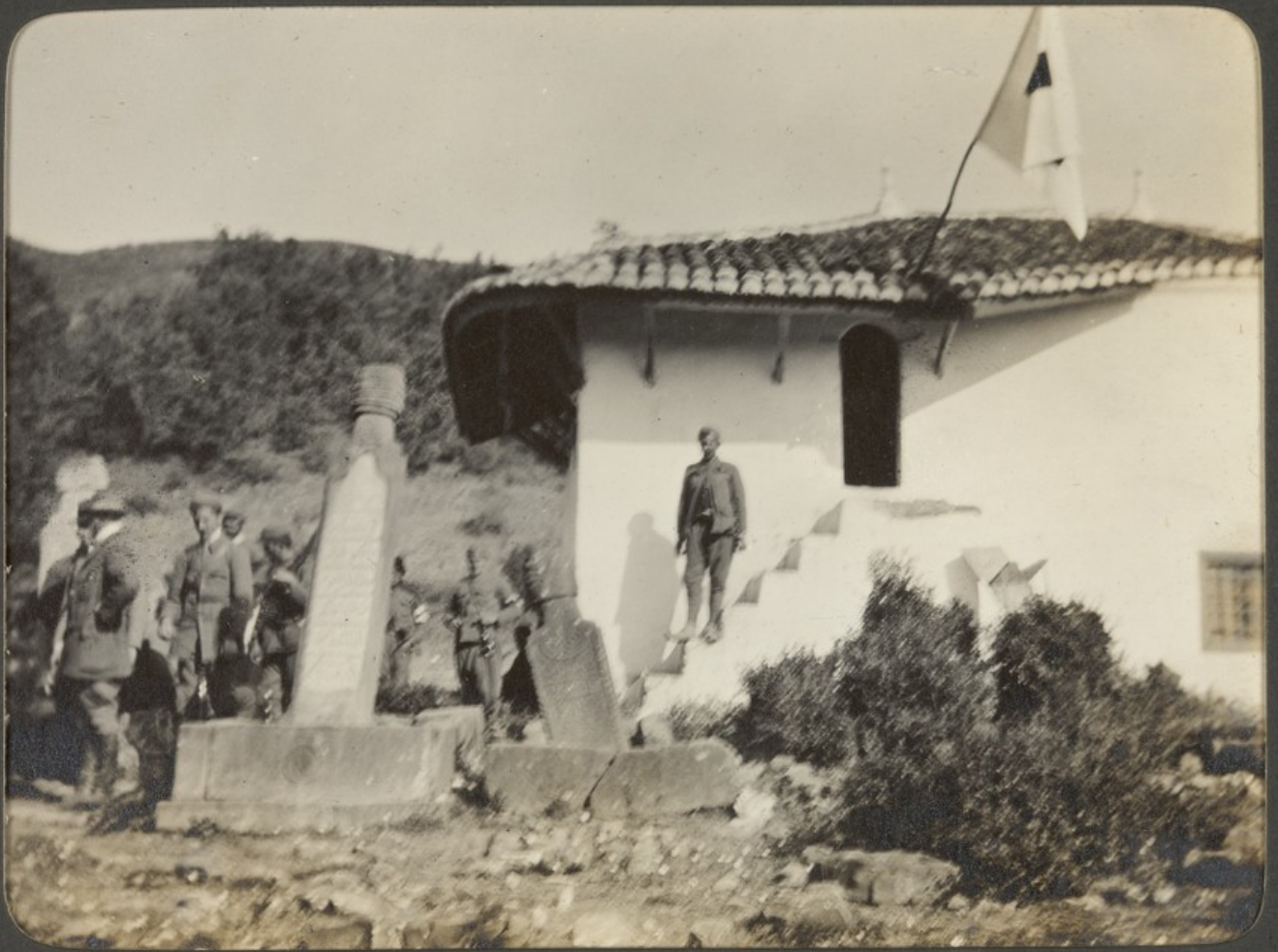
Mosque used for hospital.