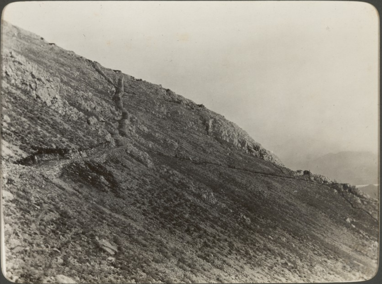
Gun position on Shirokagora, showing gun roads