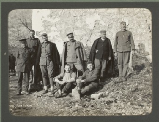
Our Xmas party.