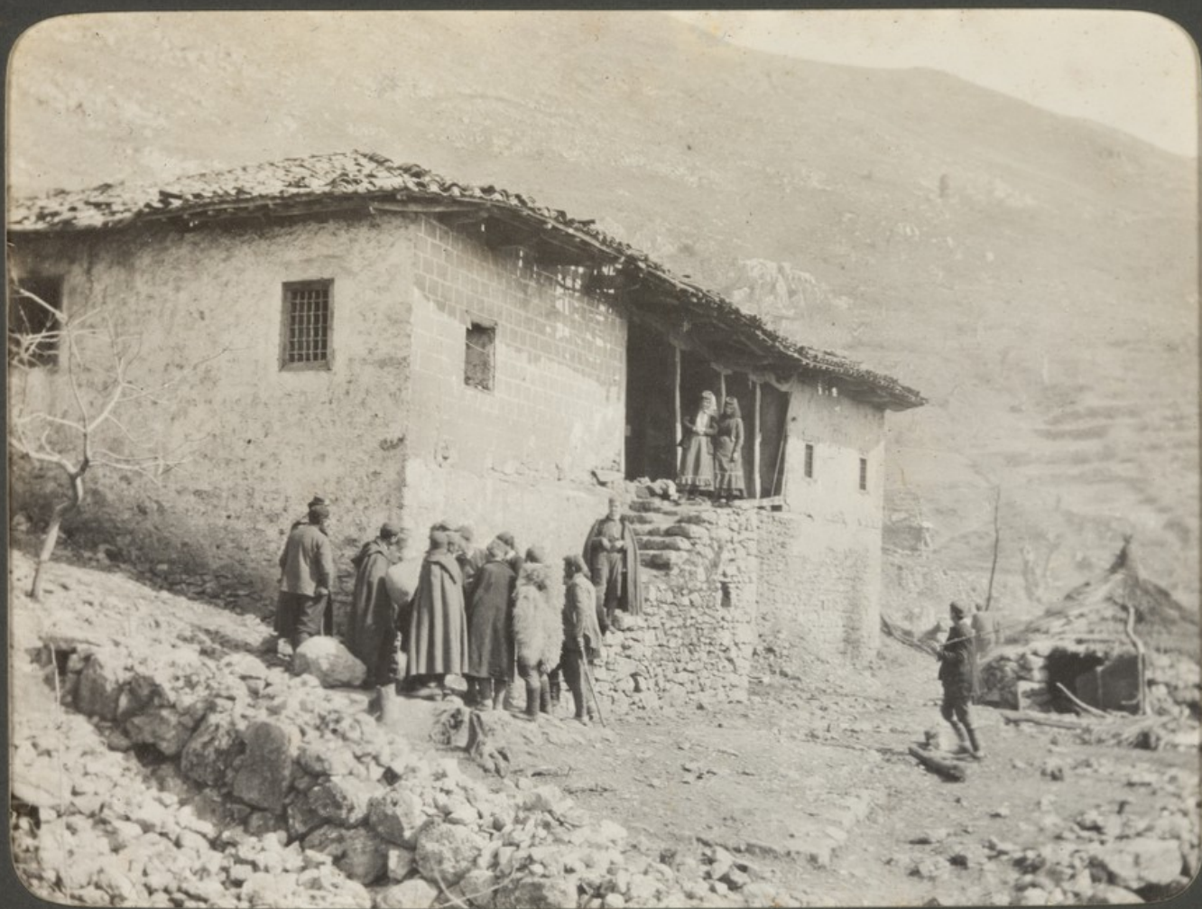
Red Cross house at Bobote