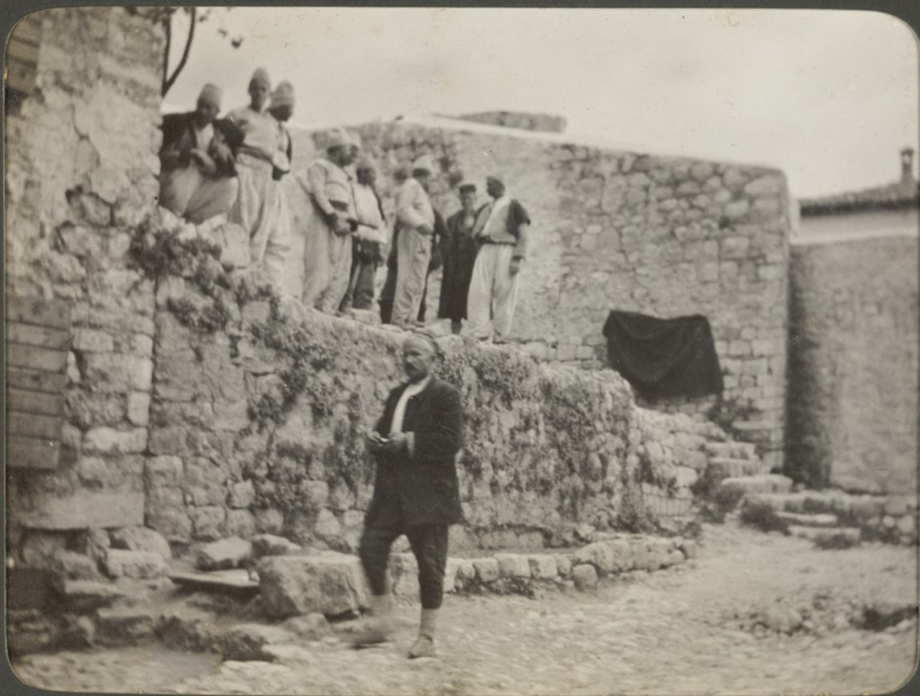
Albanian Prisoners at Old Antivari