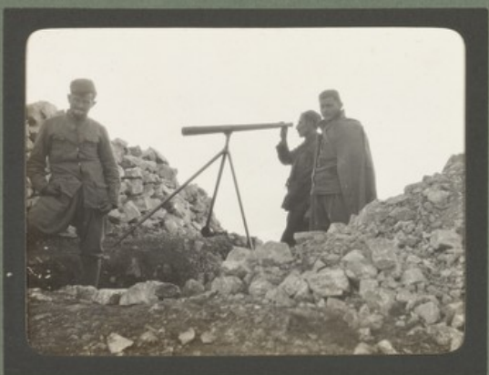
Observation post on Shirokagora.