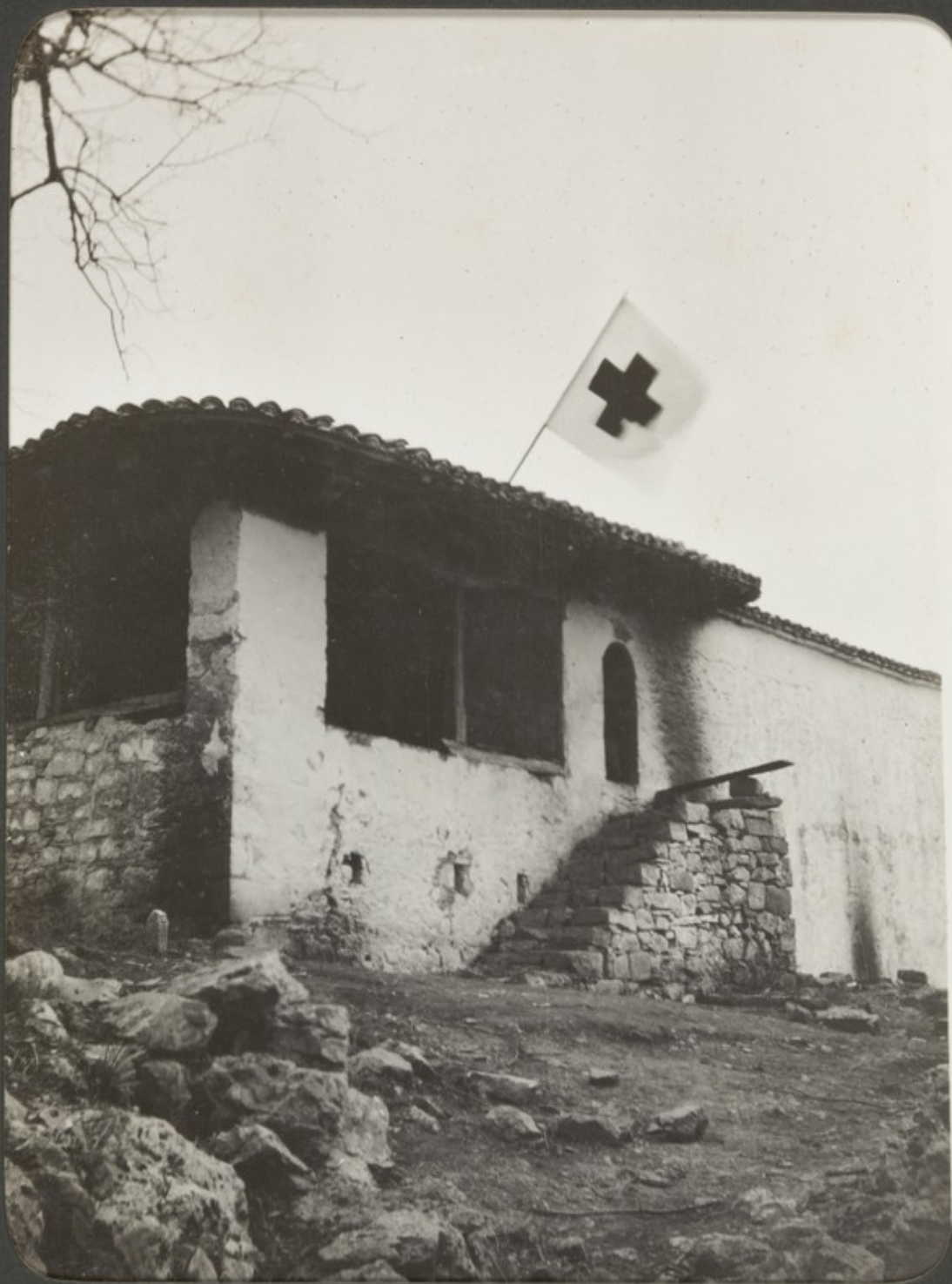
Hospital at Vilgar in Anconne.