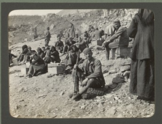
Market Place at Bobota.