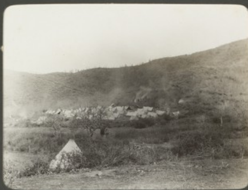
Mountain near Camp