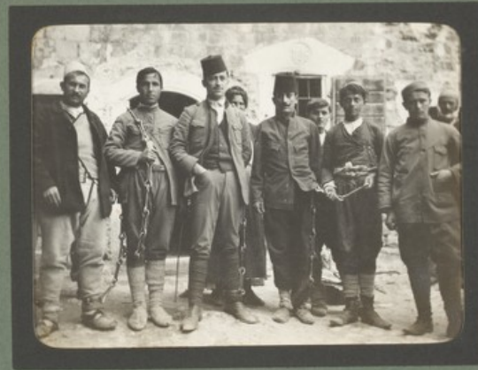
Prisoners of Old Antisana.