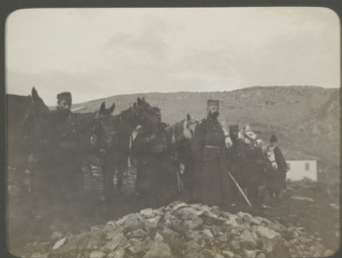
Serbian Cavalry at Metkovic