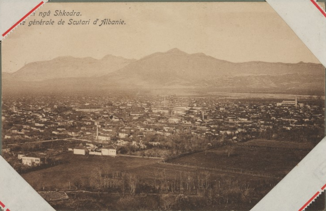
Shkodra. générale de Scutari d'Albanie.