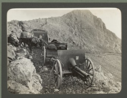
Turkish Field Guns captured by Serians.