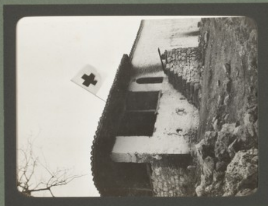
Hospital at Veldpa in Hungary.