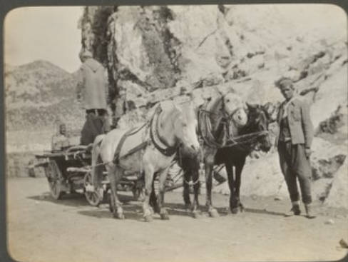
Loading Ammunition on wagon.