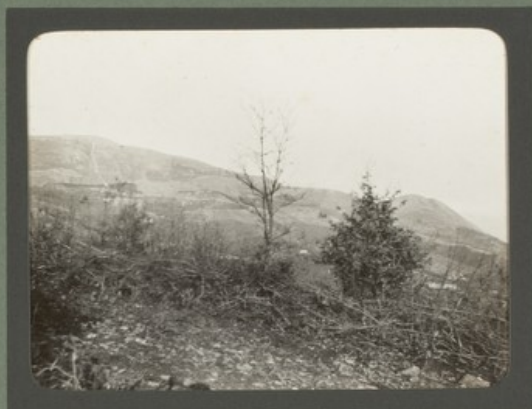
Great & little Tashabosh.