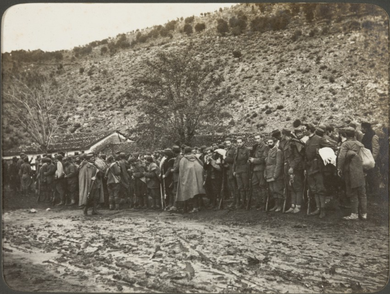
First Cox of hunting in the area