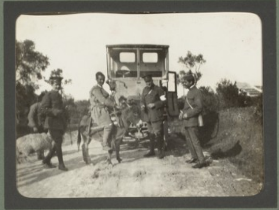
Motor car at Antivara