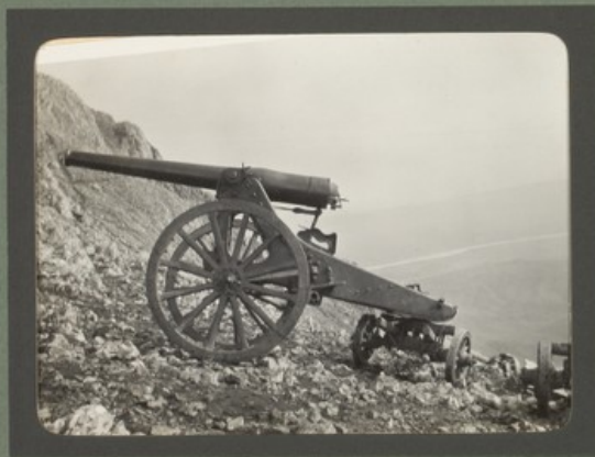
Italian gun bulged breech nearly blown out.