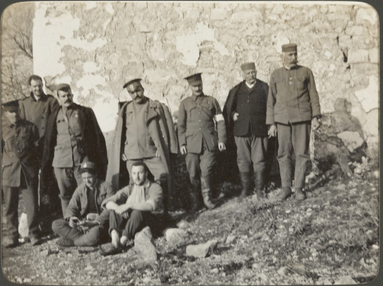
Our Xmas Party