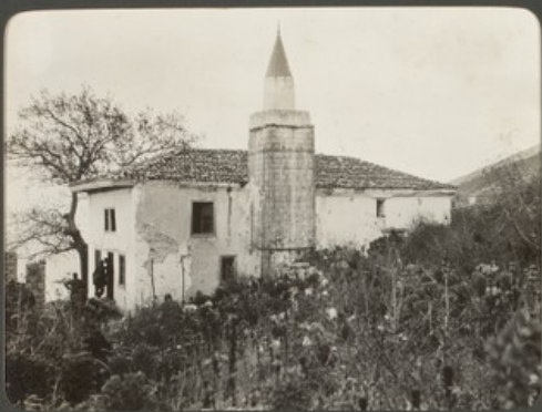
Mosque at Zogaj - Hospital