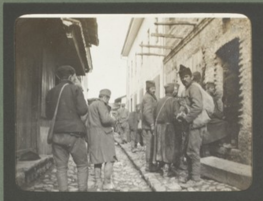
Serbian in Alessio