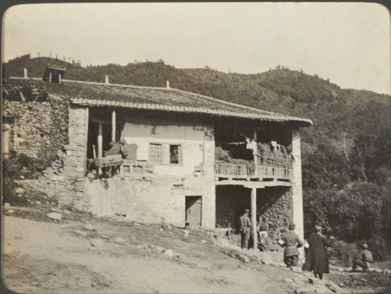
Munichian - Hd. Qrs of Gen Martynovitch