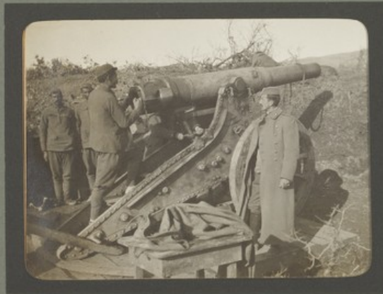
Russian 6 th Jan