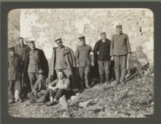
Our Xmas Party