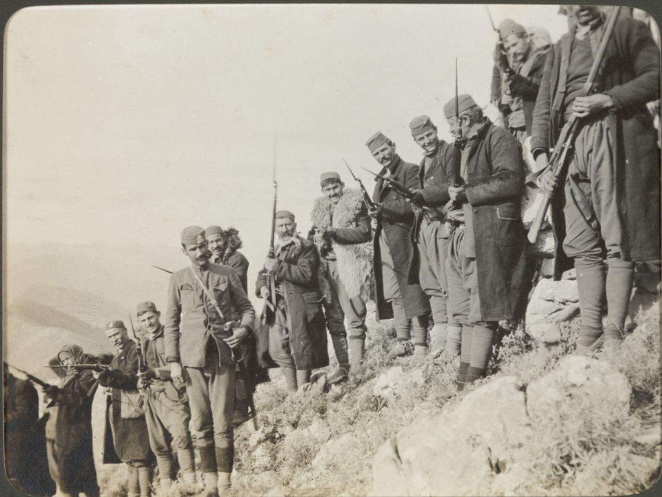
Montenegro on Shirokagora.