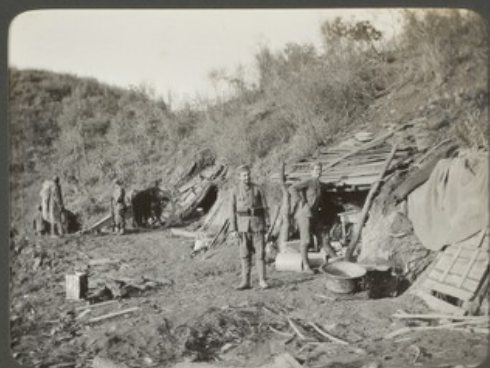
A gun position.