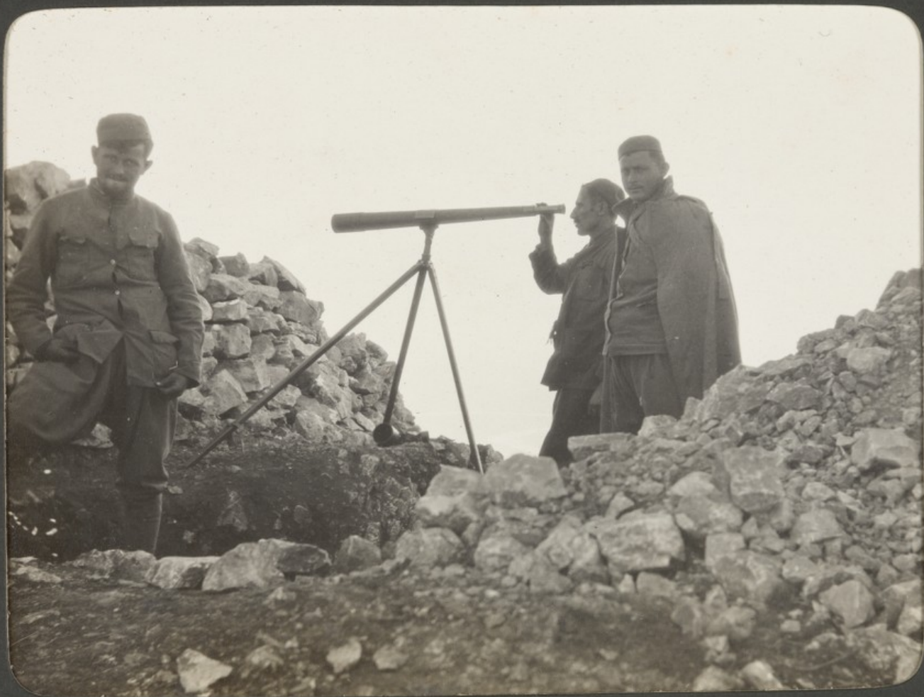
Observation post on Shirokagora