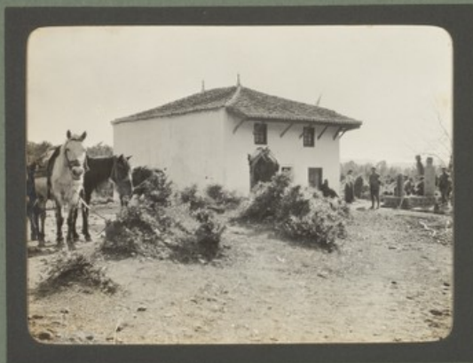
A Red Cross Hospital