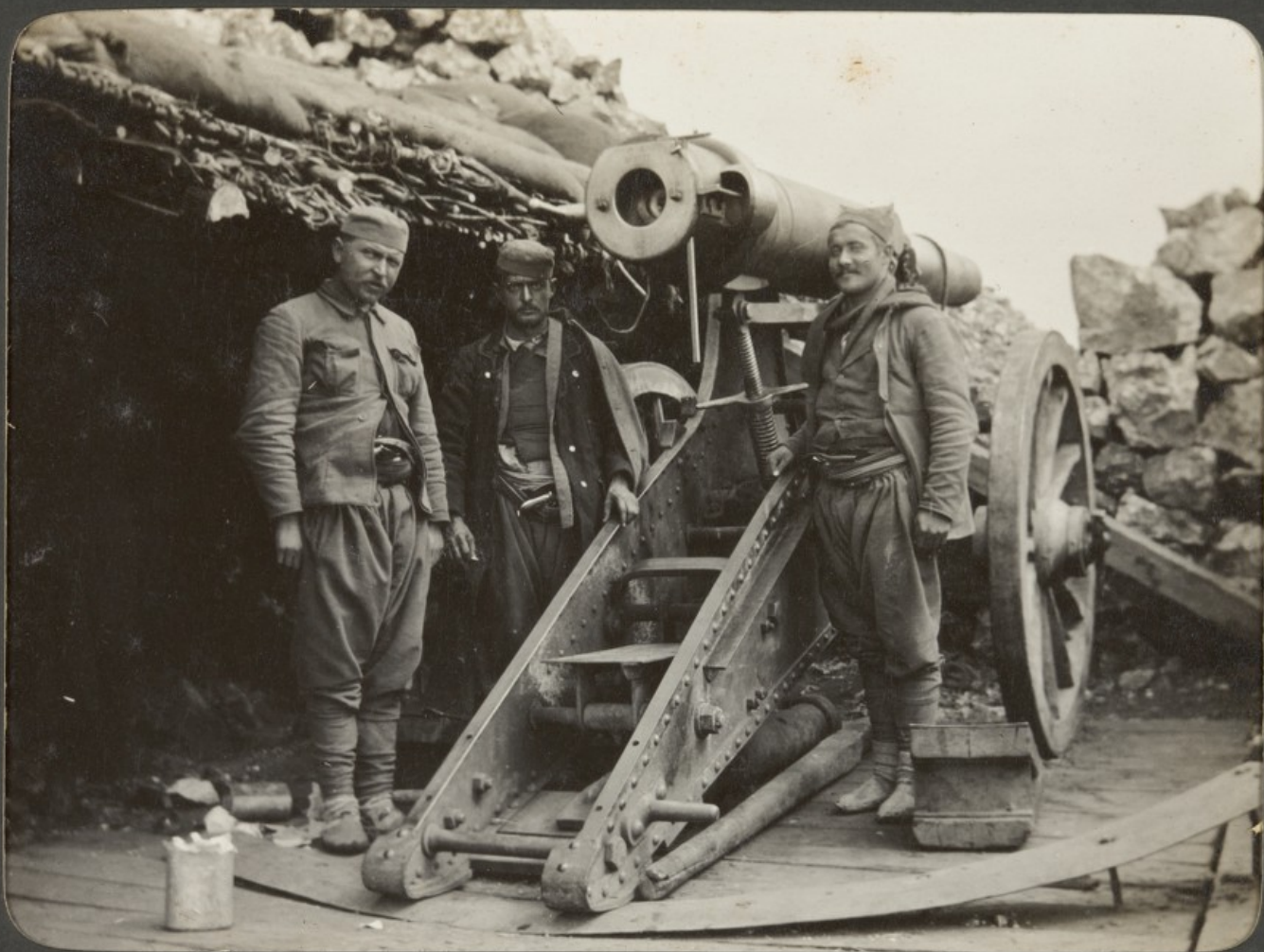
1" Russian gun