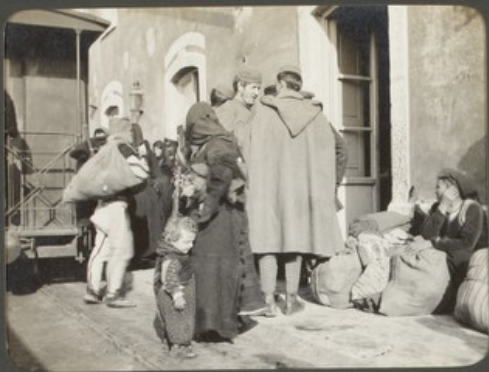
Vipazan Railway Station