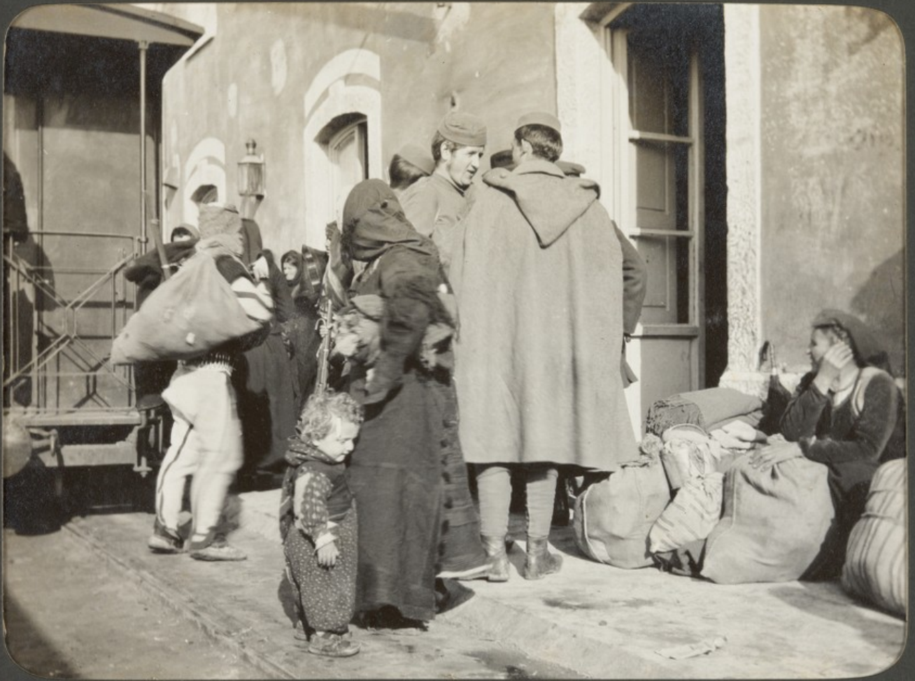
Virpagan Railway Station