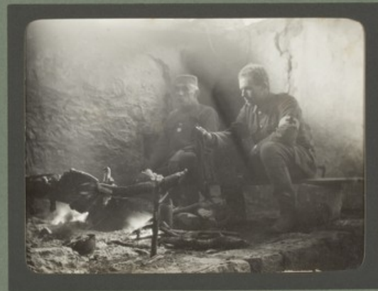
Roasting a goat