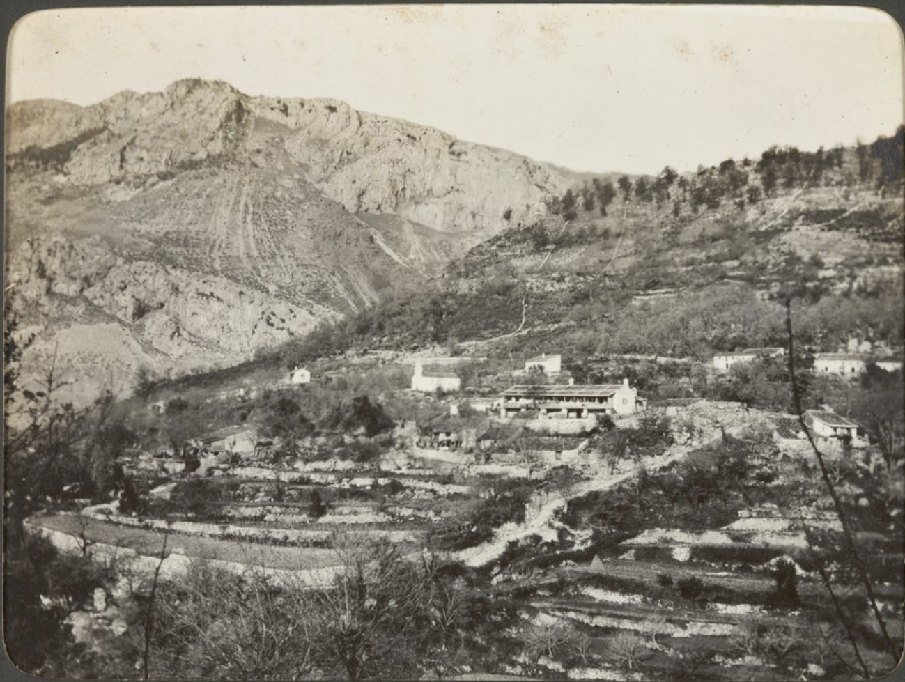
Puerto Negro, Durango