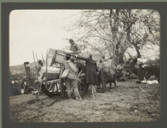
Red Cross moving camp