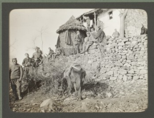
Montenegrins living in Turkish houses.