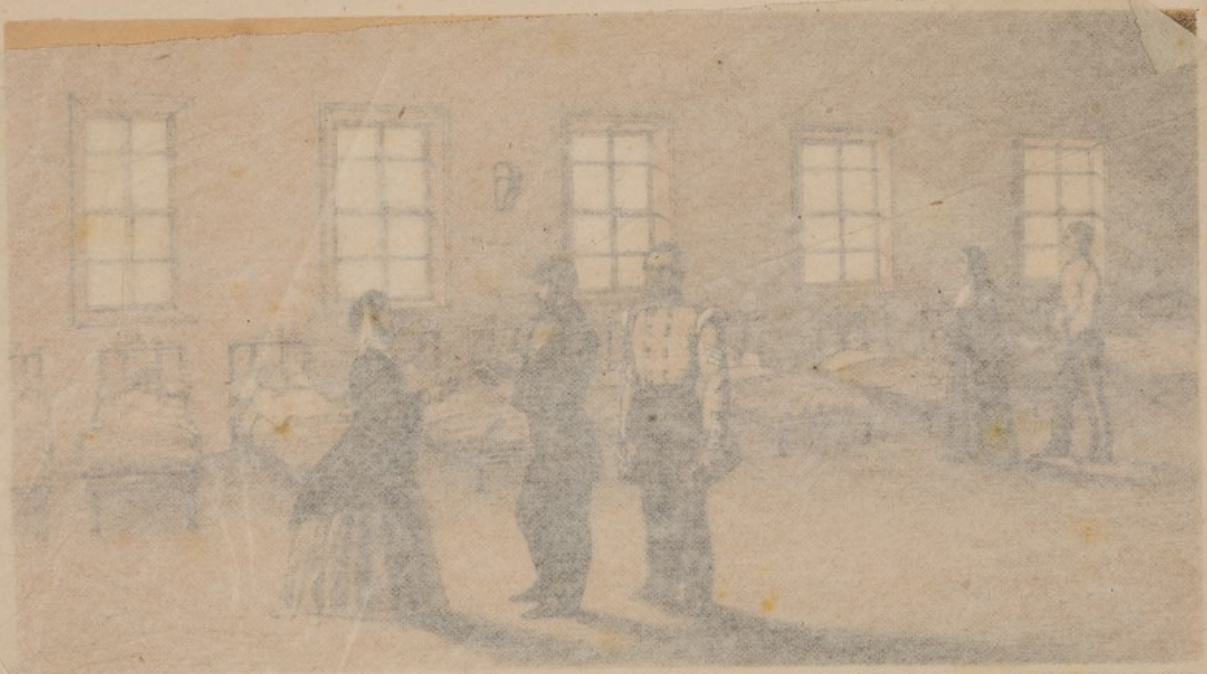
LOWER STABLES WARD, KHULALI BARBACK HOSPITAL.