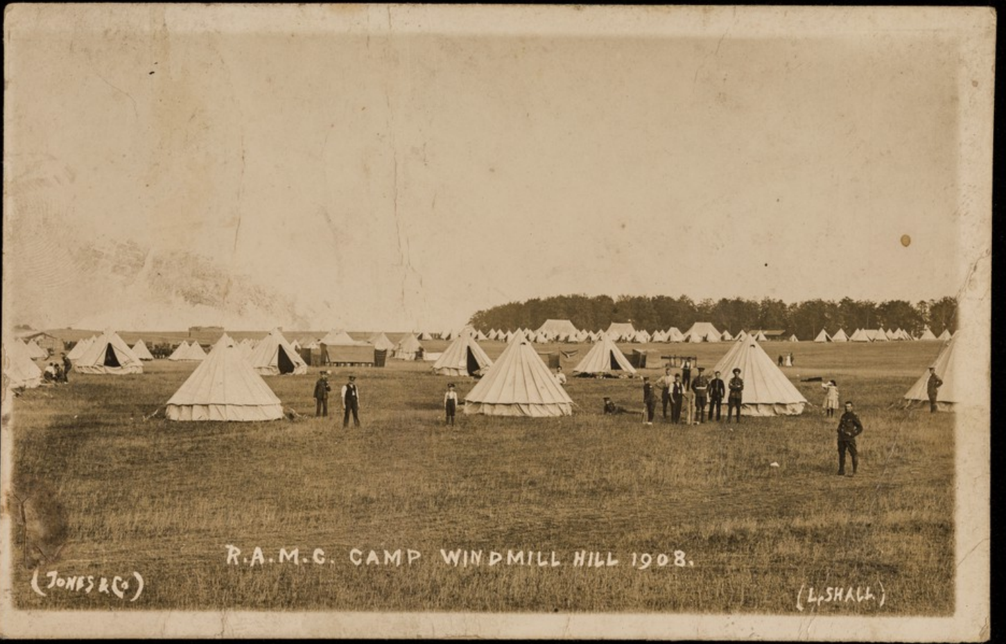
R.A.M.C. CAMP WINDMILL HILL 1908.