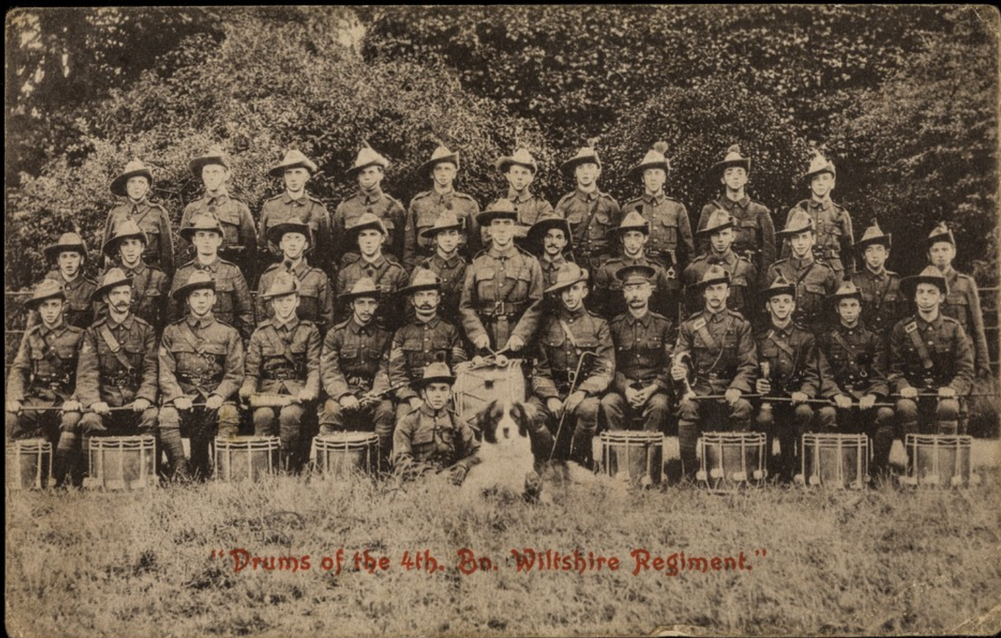
"Drums of the 4th. Bn. Wiltshire Regiment."