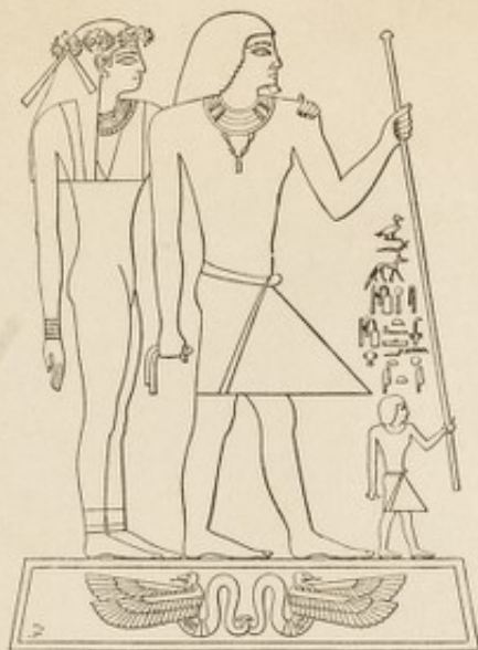
PEHENUKA, AN EGYPTIAN PRIEST-PHYSICIAN OF THE V DYNASTY, AND J'efa-SEN, HIS WIFE

WR2/31/2 (A.W.) SNOW HILL BUILDINGS LONDON, E.C.