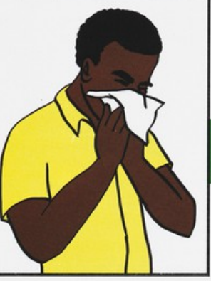
Tumia karatasi za 'tishu' kisha zitupe...