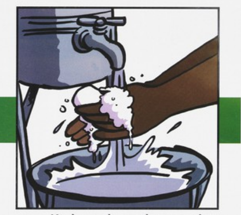
...Kisha osha mikono yako.