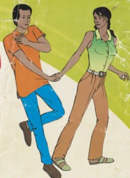
Sexual Contact with an HBV chronic carrier or infected person

Live the events in your life without the risk of Hepatitis B