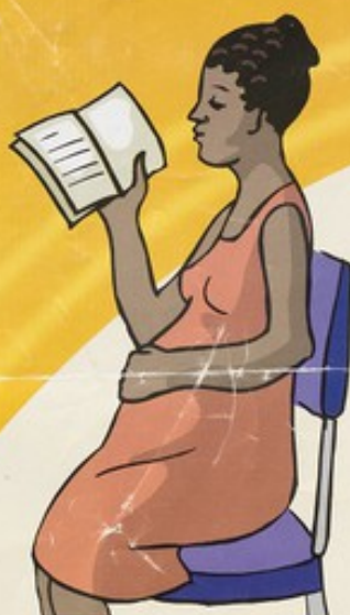
Transmission from a HBV carrier mother to her baby at the time of birth