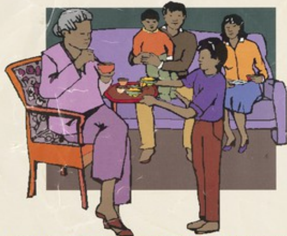
From close household contacts with a HBV chronic carrier or infected person

Live the events in your life without the risk of Hepatitis B