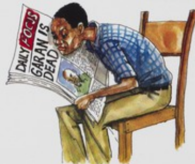
Changes in vision