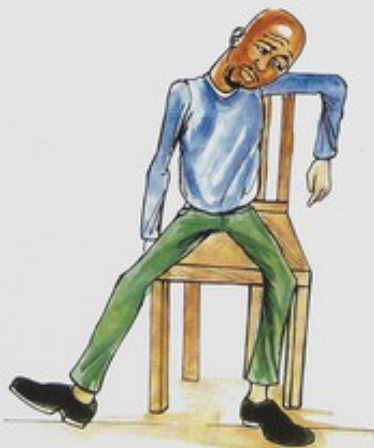
Excessive tiredness and drowsiness