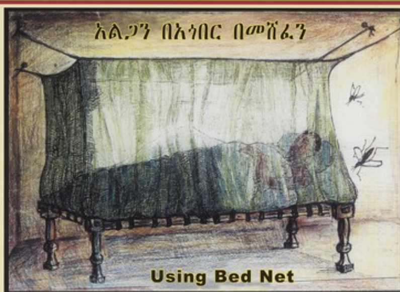
Using Bed Net