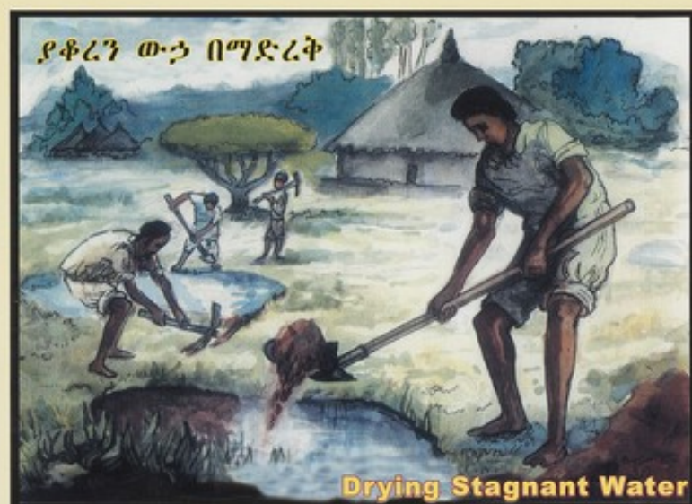
Drying Stagnant Water