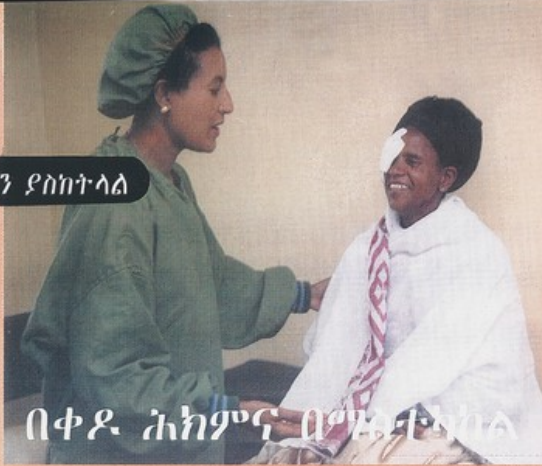
በቀዶ ሕክምና በማግኘት