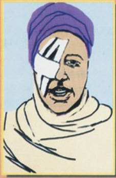
በቀዶ ሕክምና በማስተካከል