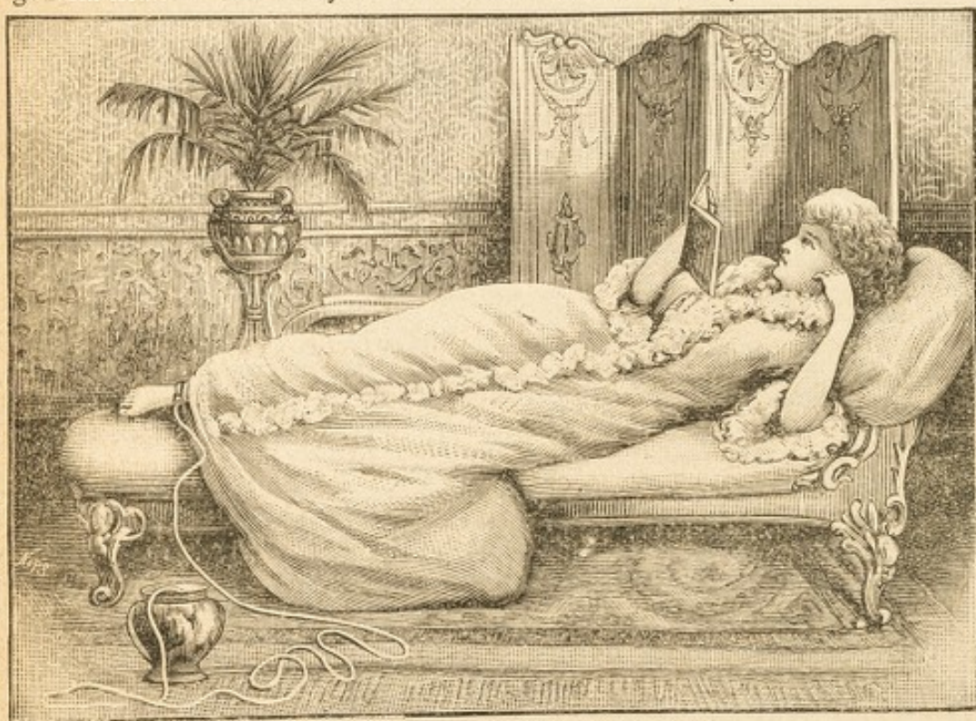
ORDINARY METHOD OF USE.

I N curing or greatly alleviating actual disease, especially chronic cases of Rheumatism, Indigestion, Nervous Disorders, Neuralgia, Insomnia, Paralysis, Liver and Kidney troubles and the like, the Electropoise has won its way, succeeding often where all else has failed. But it is also an invaluable and unequalled tonic and builder up of a system generally run down without being afflicted with any special malady. You should have one if only for the promotion of sleep and the assimilation of food, for the benefit of the general health. No family should be without an Electropoise .