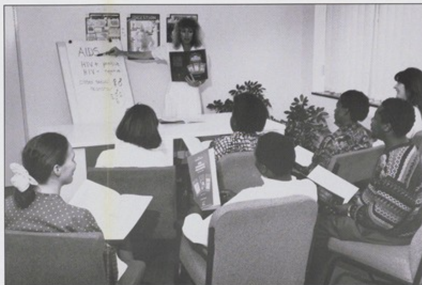
The training of teachers is an important part of the Macmillan Boleswa AIDS Awareness Programme.

The results of this trial were so positive that we went on to develop more readers for Botswana, as well as for other regions, incorporating the improvements that were suggested during the trial.