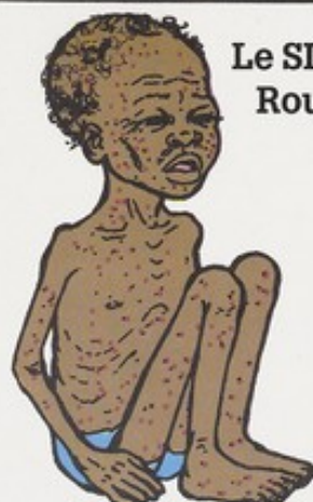
Le SIDA ou la Rougeole?