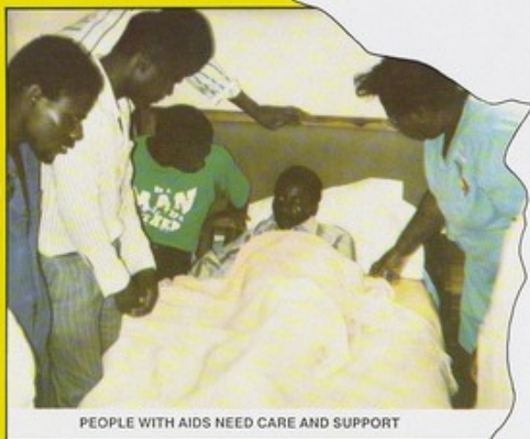
PEOPLE WITH AIDS NEED CARE AND SUPPORT