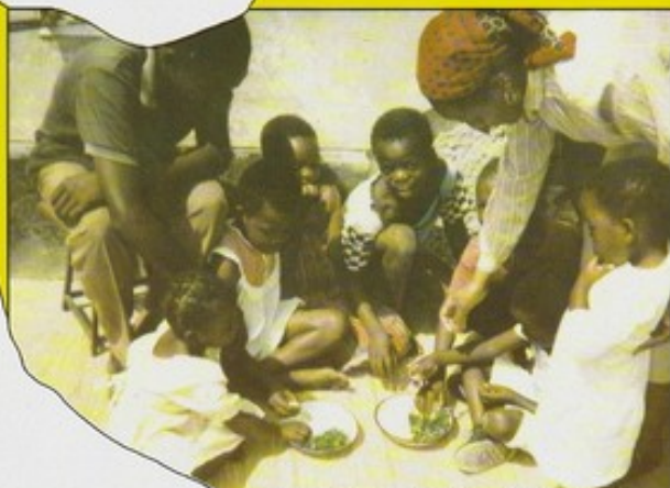
CARE ENOUGH TO LOVE AND SUPPORT THE YOUTH - TO ENSURE AN AIDS FREE GENERATION