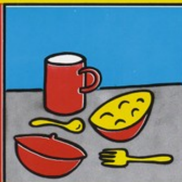
SHARING CUPS, PLATES, KNIVES AND FORKS