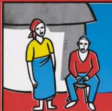
LIVING WITH A PARENT OR RELATIVE WITH AIDS