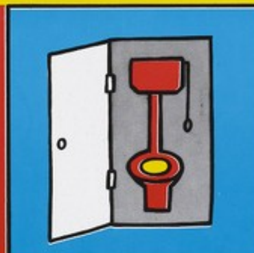
SHARING TOILETS AND BATH TUBS