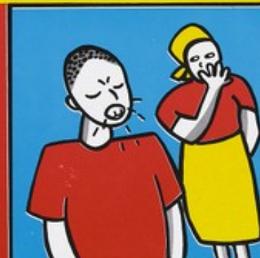
COUGHING, SNEEZING OR TALKING