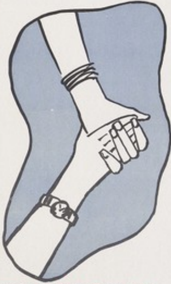
সাময়িক স্পর্শ বা আলিঙ্গন থেকে