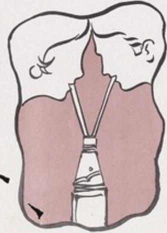
খাদ্য বা পানীয় ভাগ করে খাওয়া থেকে