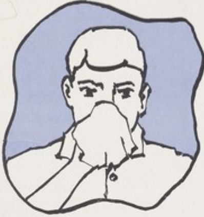
কাশি এবং হাঁচির দ্বারা