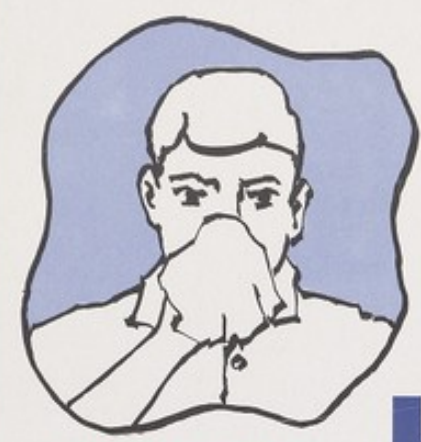
COUGHS AND SNEEZES