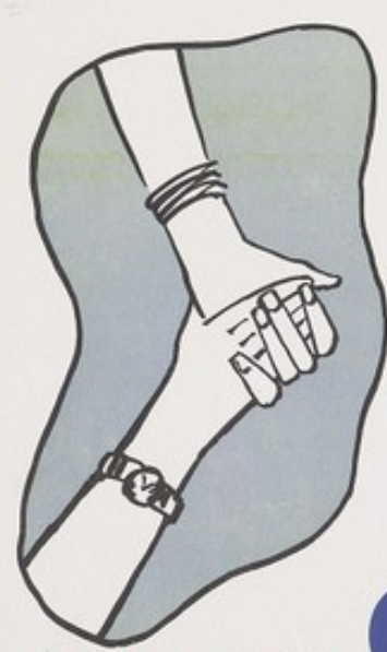
CASUAL TOUCH OR HUG