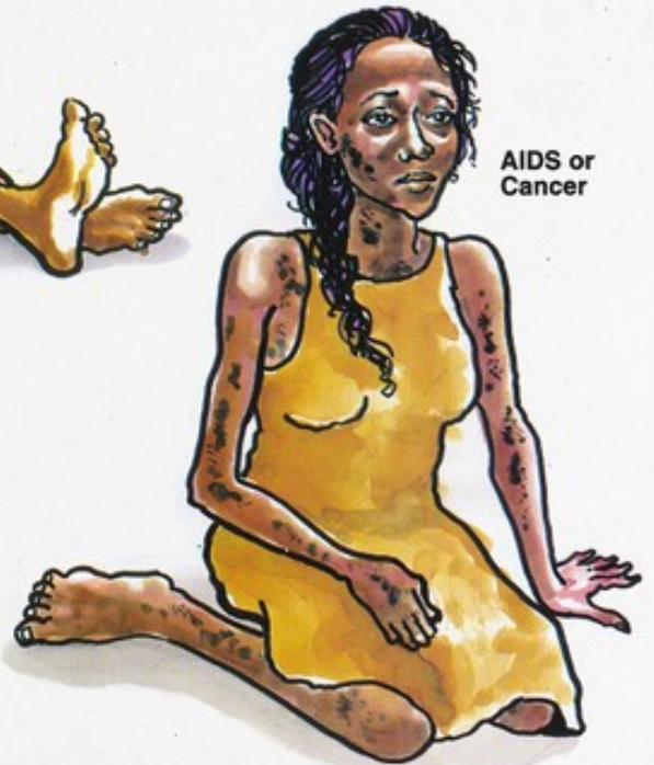
AIDS or Cancer