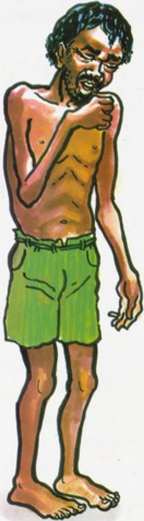
AIDS or Tuberculosis