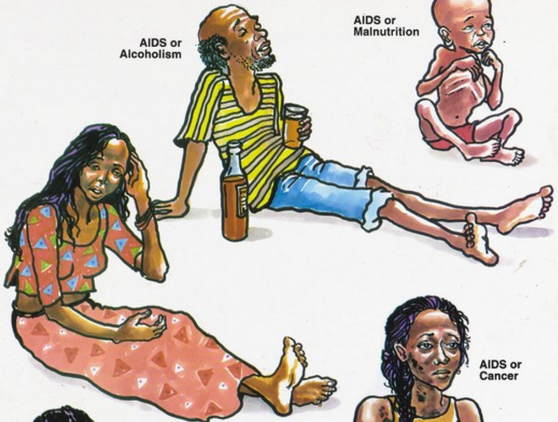
AIDS or Malnutrition