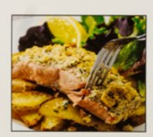
Herb Crusted Salmon Fille Oven baked salmon fillet topped with a light herb crust and served with roast potato wedges and a mixed leaf salad.

Loin of tuna served with a selection of Mediterranean vegetables and a five bean salad.