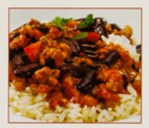
Chilli Con Carne Lean minced beef with chilli in a tomato sauce with red kidney beans, served on a bed of rice.