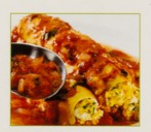
and Herb Cannelloni filled with roasted squash, mediterranean vegetables, cream cheese and a selection of delicately flavoured herbs,