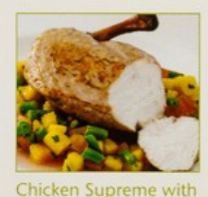
a Lime Salsa Farm assured chicken supreme, oven baked and served with a tangy lime, mango and pomegranate salsa.