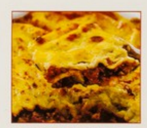
Vegetable Lasagne Layers of pasta, courgette, tomatoes and Quorn, oven baked with cheese in a creamy sauce served with a mixed leaf salad.