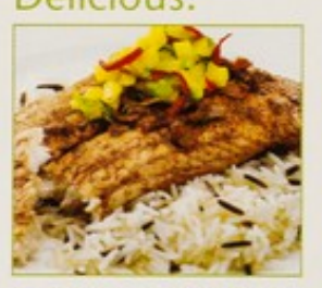
Jerk Fish with Wild Rice Oven baked sustainable fish marinated in caribbean mojo spices and served with mango and avocado salsa on a bed of rice