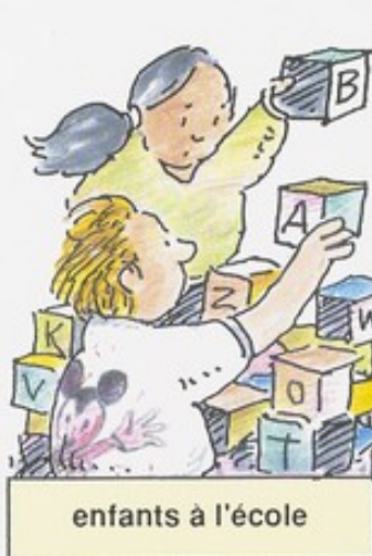
enfants à l'école