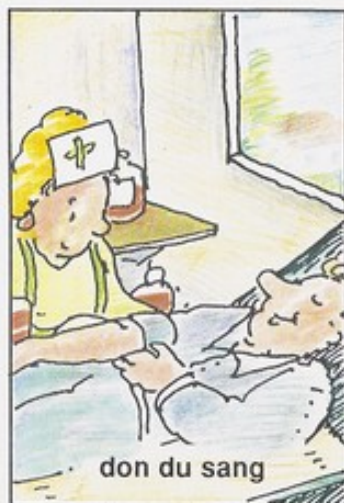
don du sang