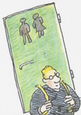
douches - toilettes