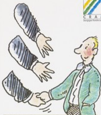
foule, poignées de mains