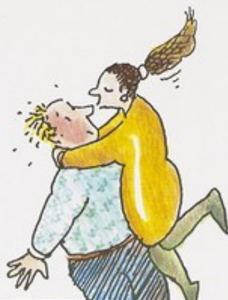
embrassades, salive et larmes