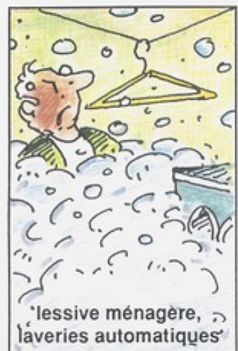
'lessive ménagère, laveries automatiques'