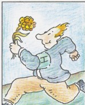
visites à l'hôpital