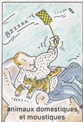
animaux domestiques et moustiques