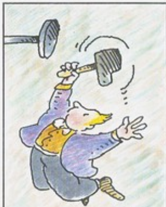
lieu de travail