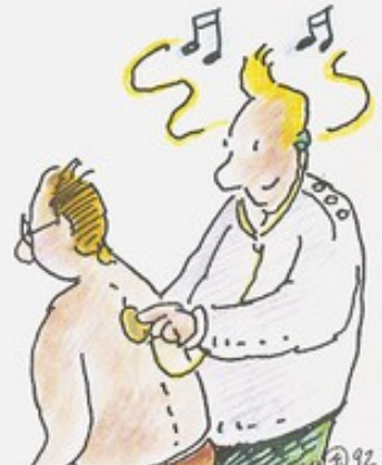
médecin, dentiste, acupuncteur