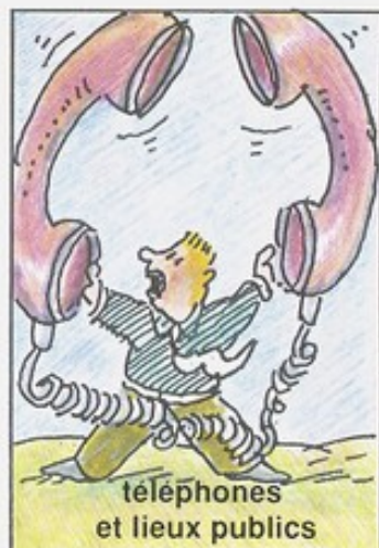
téléphones et lieux publics