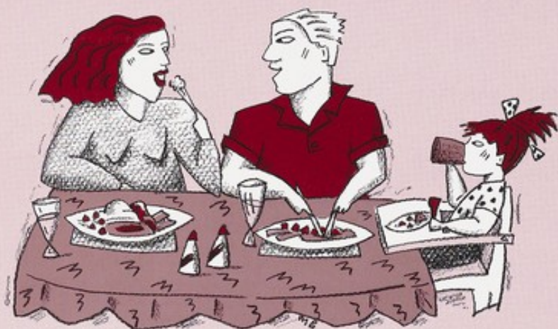
living with someone who has HIV