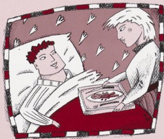
looking after someone who has HIV