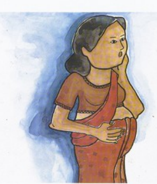
HIV infected mother to infant, before, during and after child birth.

HIV SPREADS THROUGH SPECIFIC INDENTIFIABLE HUMAN ACTIONS, ALL SUBJECT TO HUMAN INFLUENCE AND CONTROL.