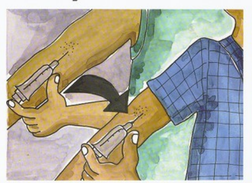
Blood-sharing HIV contaminated needles or other skin piercing instruments.