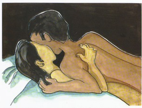
Sexual intercourse — from any HIV infected person to his or her partner (man to woman, woman to man, man to man). Women are more at risk than men.