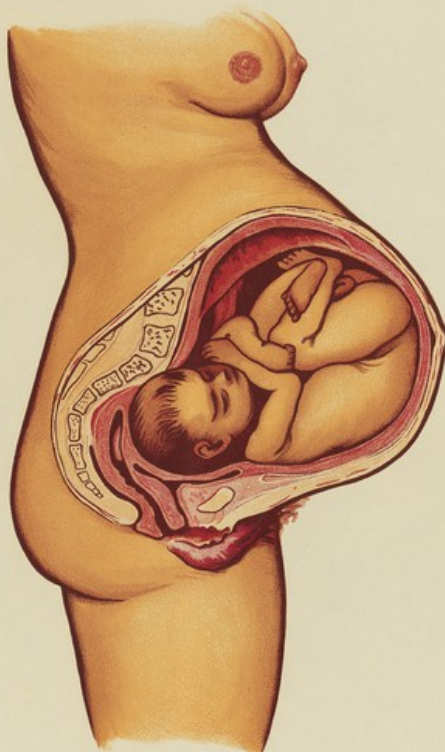
Матка на 9-ом месяце беременности.