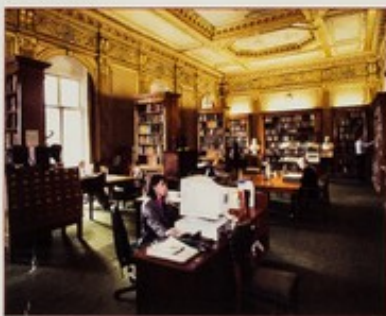
Library Reading Room