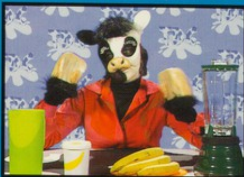
'PAT THE COW' The Dairy Channel Host