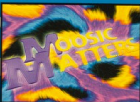
'MOOSIC MATTERS' Contemporary Music Show