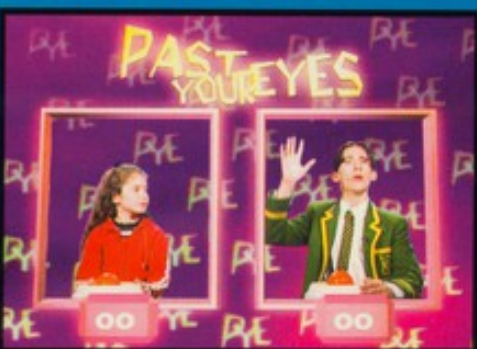
'PAST YOUR EYES' Quick-fire Quiz Show