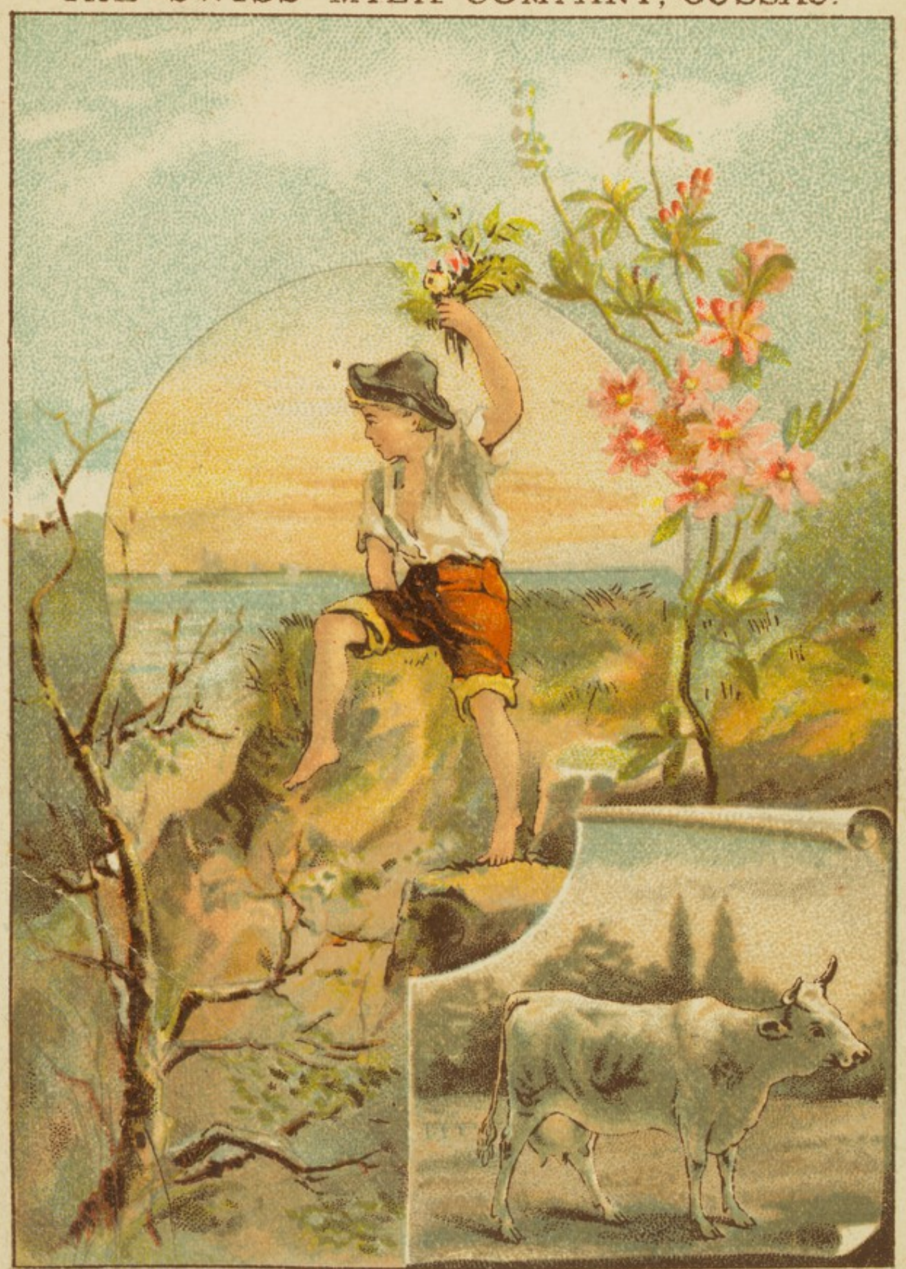
THE "EDELWEISS" BRAND