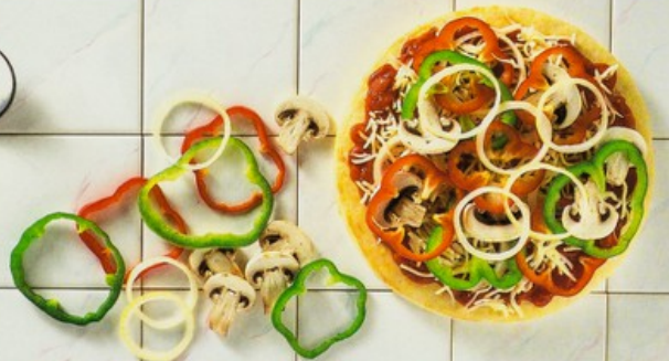
VEGGY DELIGHT - 9" Deep and Crispy Base, Tomato and Garlic Pizza Sauce, Mozzarella & Cheddar Cheese, Red Pepper Rings, Green Pepper Rings, Mushroom Slices and Onion.

All lines subject to availability, some lines available from larger stores only.