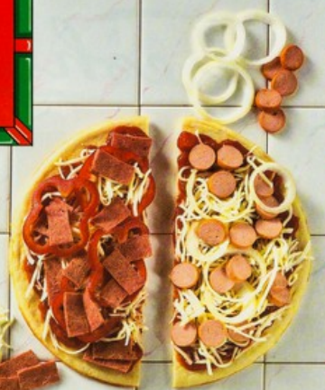
TWO'S COMPANY - TWO RECIPES ON THE SAME BASE! 9" Deep and Crispy Base, Tomato and Garlic Pizza Sauce, Mozzarella Cheese, Spicy Beef, Red Pepper Rings, Frankfurter and Onion.