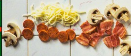
AMERICANO - 9" Thin and Crispy Base, Hot and Spicy Tomato Pizza Sauce, Mozzarella Cheese, Pepperoni, Smoked Cooked Bacon and Mushroom Slices.