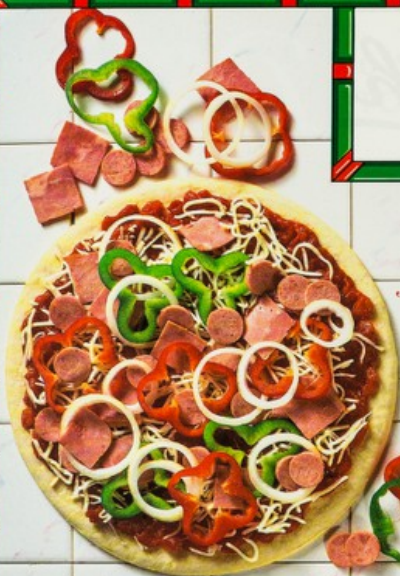
FAMILY FEAST - 12" Deep and Crispy Base, Tomato and Herb Pizza Sauce, Mozzarella Cheese, Garlic Sausage, Ham, Red Pepper Rings, Green Pepper Rings and Onion.

Create your own Deliciously Fresh Pizzas. Choose from our exciting Toppings and Bases. All Toppings come in generous 'Pizza Size' portions. It's Quick, Easy and Fun!