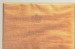
1 Plain assortment