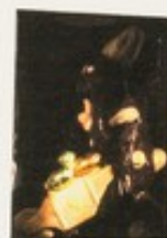
8 Wheelbarrow Bunny