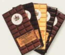
5 Chocolate Bars