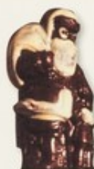
7 Small Santa