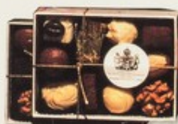
12 Theatre Box