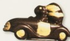
12 Bunny with Car