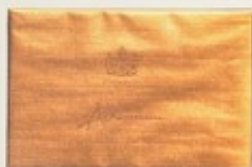
2 Plain assortment