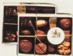
14 Theatre Box