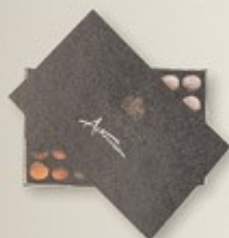
5 After dinner truffles