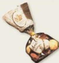
6 Assorted Truffles