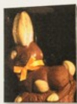
11 Large Sitting Bunny