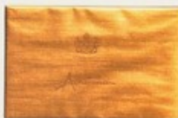
3 Plain assortment