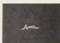
6 Champagne truffles