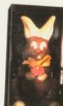
7 Bunny with Sugar Flower