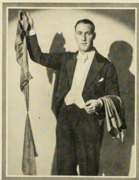
FAST OR LOOSE

An amazing feat of divination performed whilst blindfolded.