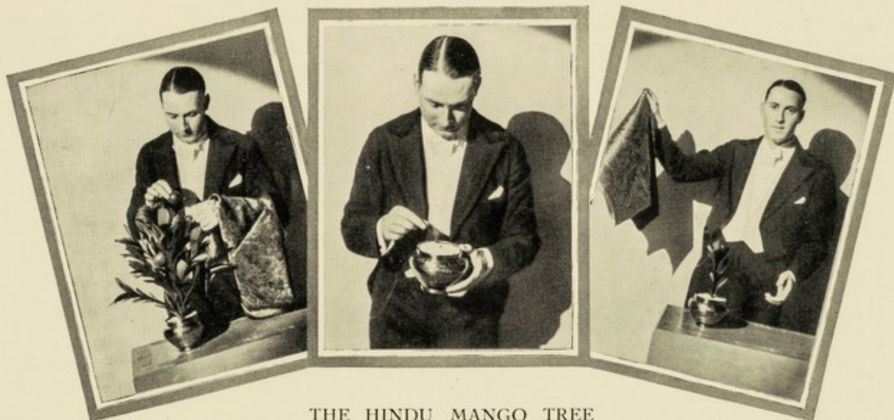
THE HINDU MANGO TREE