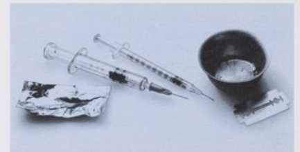
DON'T INJECT. NEVER SHARE.

Anyone who misuses drugs should not inject. If you ever do, never share equipment (needles, syringes, mixing bowls, etc.). You could be injecting the virus straight into your blood stream. It is extremely dangerous.