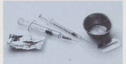
DON'T INJECT. NEVER SHARE.

Anyone who misuses drugs should not inject. If you ever do, never share equipment (needles, syringes, mixing bowls, etc.). You could be injecting the virus straight into your blood stream. It is extremely dangerous.