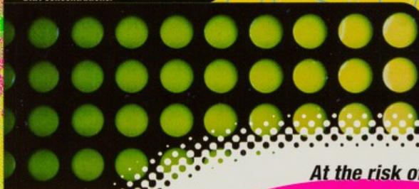
PicoGreen® dsDNA Quantitation Reagent. The most sensitive method for measuring DNA concentrations.