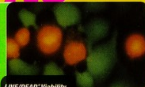
LIVE/DEAD® Viability Kits. One-step assay for differential staining of live and dead cells.

CytoFluor® Series 4000 Multi-Well Fluorescence Plate Reader from PerSeptive Biosystems