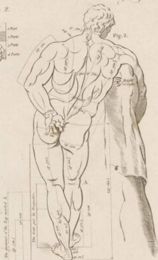
Back View of the statue of Hercules which measures 7 heads, 4 parts and 1/2 inches, appearing 12 parts high.