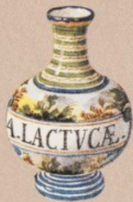
VENETIAN DRUG BOTTLE c 1700