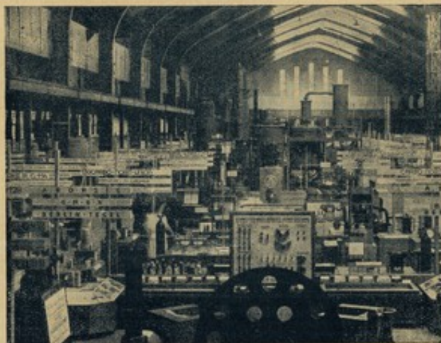
ACHEMA VI. Part view of the large plant section in Hall IV (75,000 sq. ft.)

to gather ideas for the improvement of his works practice, to become acquainted with new instruments and new plant, and to lay the foundations for the development of his by-products, through the personal interchange of opinion with leading experts of the machine-, plant- and instrument-industries.