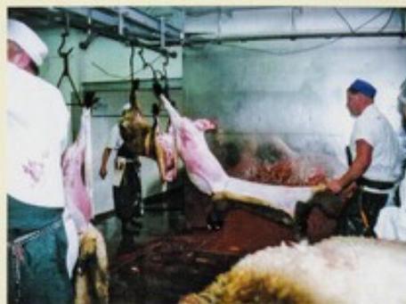
Some sheep are still alive when skinned

Most cattle are stunned with the captive bolt pistol, which drives a metal bolt into the skull. Mushroom-headed stunners supposedly deliver a massive, concussive blow.