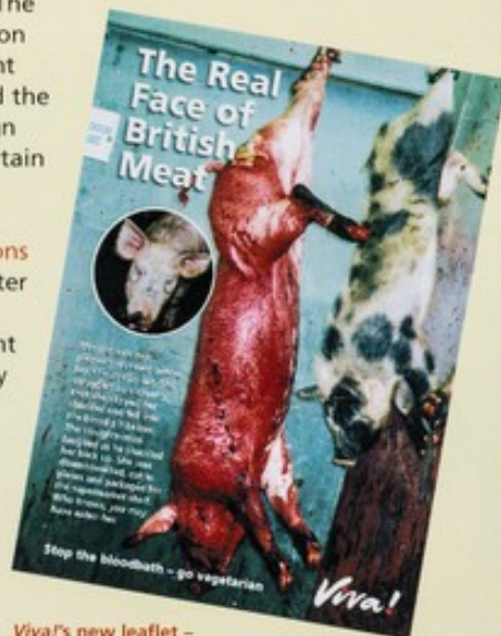
Viva!'s new leaflet – The Real Face of British Meat

Viva! has filmed undercover and produced a 58-page scientific report into the UK's animal killing industry. The findings have already been revealed to over one million people through an article in the Sunday Times . Excellent regional TV, radio and newspaper coverage has carried the facts to millions more. Our new, hard-hitting campaign leaflets are being distributed in high streets across Britain and they show nothing but the shocking truth.