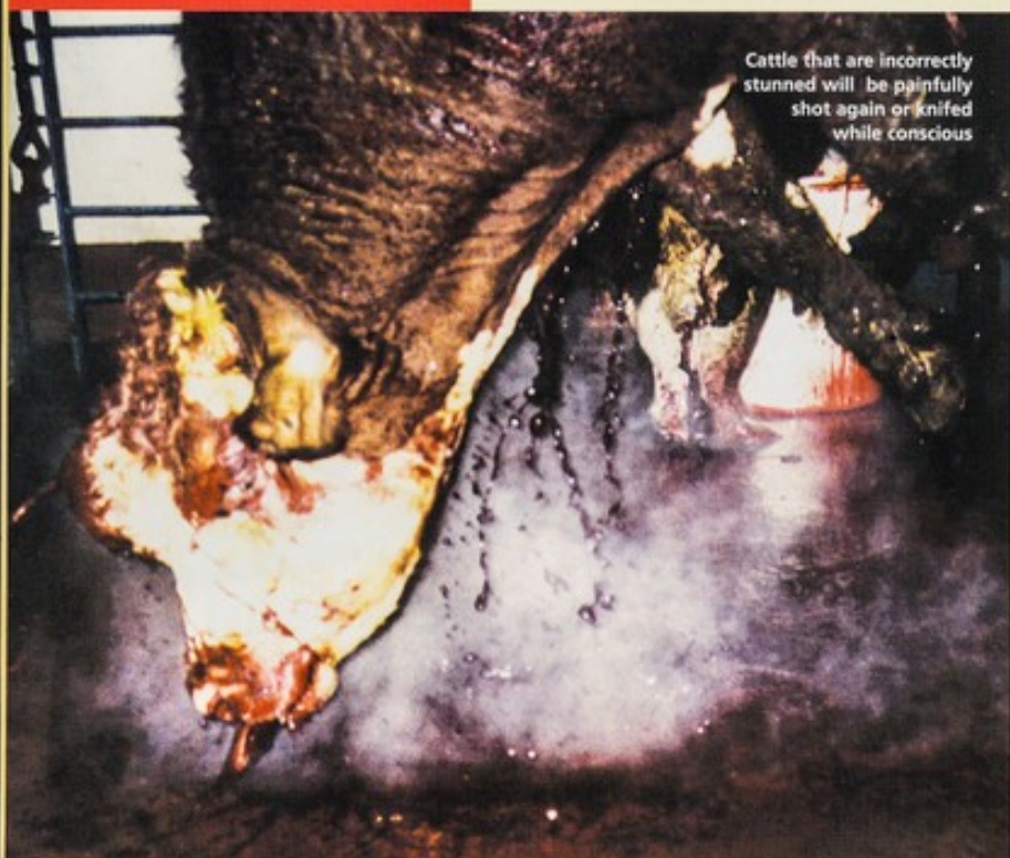
Cattle that are incorrectly stunned will be painfully shot again or knifed while conscious

Shackling chickens and turkeys causes extreme suffering. Stunning with a water