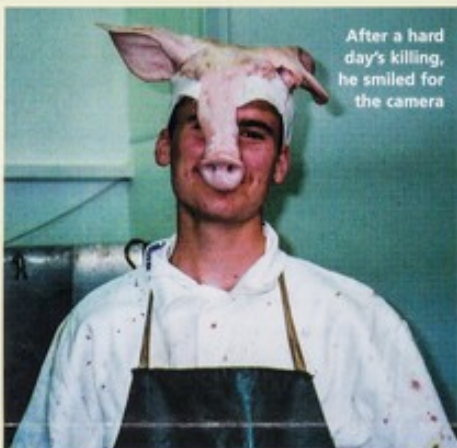
After a hard day's killing, he smiled for the camera

But Viva! has filmed stunning and killing and we have reviewed the latest scientific research on slaughter. Between the two, we have built up a disturbing picture of so-called 'humane' slaughter.