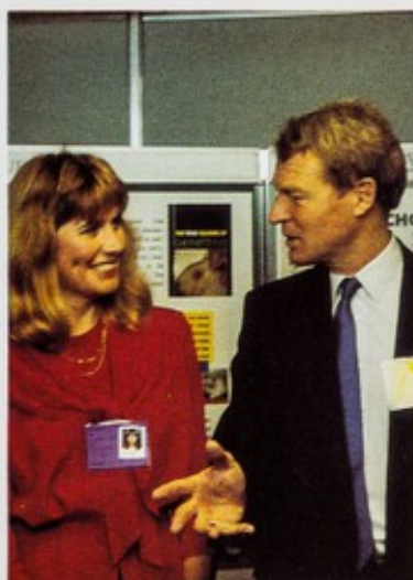
The BUAV enjoys the support of MPs and MEPs from all major parties.

But some things have changed little over the years. Just as we did in 1898, we continue to stimulate debate about the moral and scientific issues involved in animal experimentation. And whether it be in television or radio studios; the church hall or the town hall; the boardroom or the classroom – BUAV representatives can be heard speaking on behalf of suffering animals.