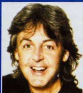
Sir Paul McCartney

whale to the smallest shrew. Now we need your help in strengthening this legislation to include the outlawing of hunting with dogs. Very few people know about the secrecy surrounding hunting and those on the inside hide the cruel truth even from their own supporters. League investigators (often undercover) regularly expose the reality of what really goes on behind the respectable facade of hunting. The League also remains vigilant for tell-tale signs of, and wherever possible brings to justice, those involved in illegal bloodsports such as badger-baiting, dog-fighting and cock-fighting.