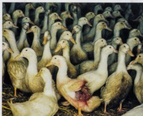
Factory farmed ducks are often covered in excreta and their injuries ignored

Recently in one unit, we saw thousands of adorable, yellow fluffy ducklings – but without their mothers to protect them, to teach them how to swim, what to eat, how to preen. In these places no one cares. These birds are to be killed for the growing market in duck meat and, like every other 'new meat', it is hailed as the healthy choice. But is it?