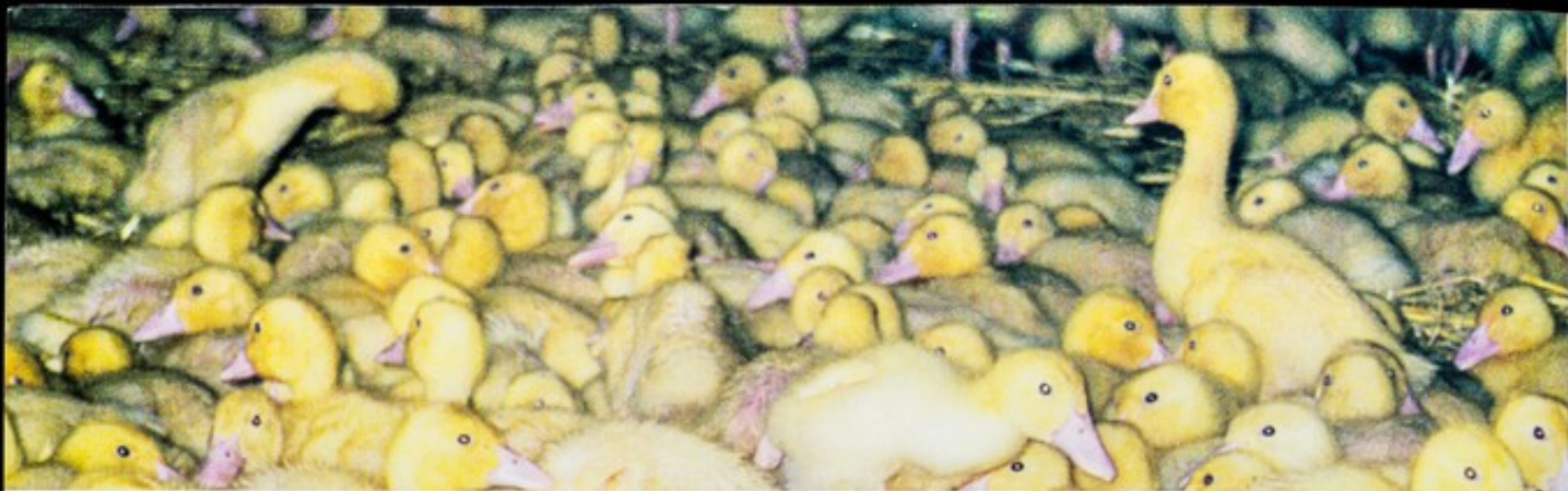
Little water birds who will never know water