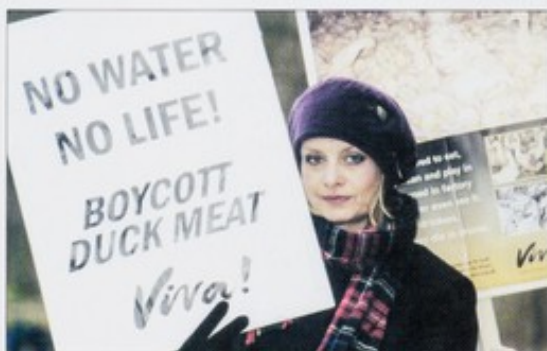
Twigg appeared on GMTV and other media to call for an end to the factory farming of ducks