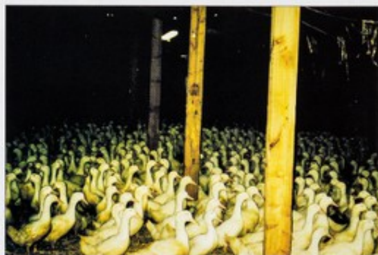
Thousands of ducks are crammed into each shed