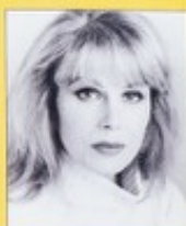
Joanna Lumley, actress

"The cruelty of modern farming has to end – and you have the power to do it. Don't buy meat from these diseased and dejected creatures."