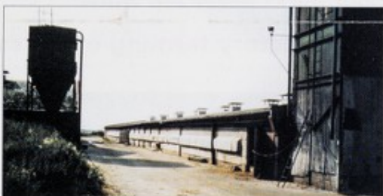
Thousands of birds are imprisoned in this Suffolk unit