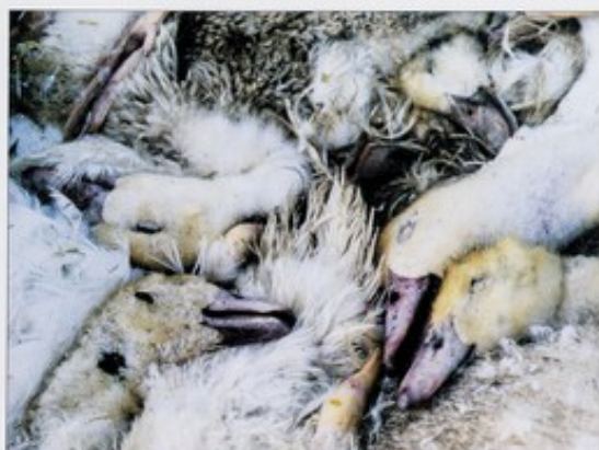
Some of the many who don't even make it to seven weeks old