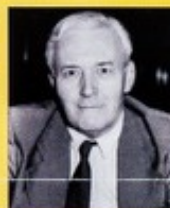
Rt. Hon. Tony Benn MP

"The systematic brutality to these creatures must be challenged. I congratulate Viva! on their work."