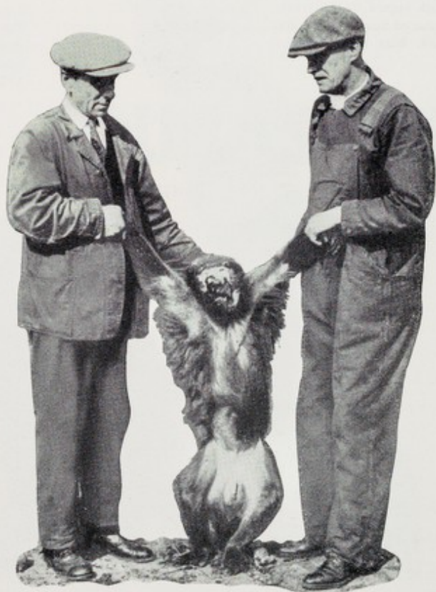
A Refractory Ape.

"The monkey was compelled to jump from a swinging trapeze to a stationary bar eighteen feet away. It missed the bar three times and fell heavily to the ground, the monkey was unwilling to jump and was made to do so by the defendant jerking the cord which he held and which was attached to the monkey. The monkey was frightened and terrified. They have to be kept up to that pitch by fear. . . . I suppose fear is at the bottom, really, of all this training?" Answer, "Quite so." (See Nos. 273, 625, 626, Blue Book 1921.)