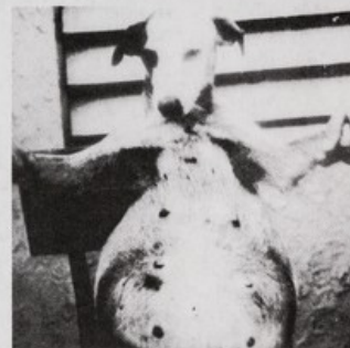
Above: Dog force-fed with alcohol.

" . . . Thus in every field of science innocent animals are made to serve as scapegoats for man's vices and faults. We smoke, animals don't: so we force animals to smoke although for them it is torture, for us pleasure. We drink alcohol, animals don't: so we cause liver cirrhoses in animals by funnelling alcohol into them. We drug ourselves, animals don't: so we turn animals into drug addicts. We suffer from insomnia owing to our daily excesses, animals don't: so we force animals to stay awake until they go crazy. We suffer from stress owing to our unnatural way of living, animals don't: so we traumatize them in rotating drums to put them in a state of stress. We cause car accidents